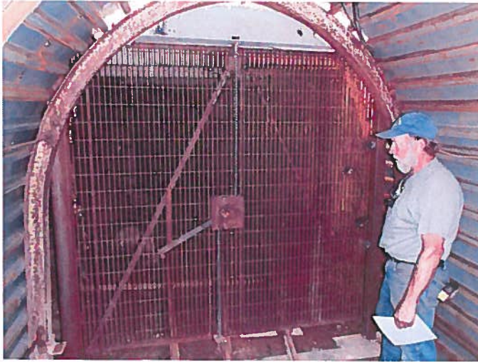
Figure 5: Clark Tunnel