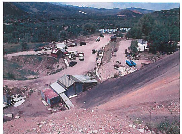
Figure 8: View from No. 2 Dump area