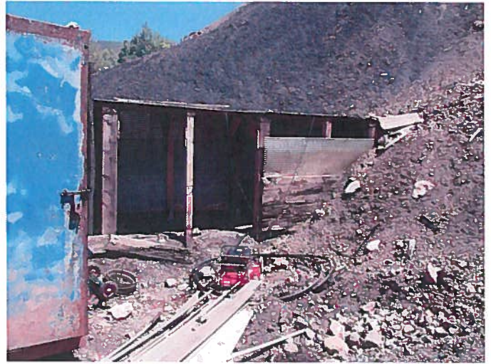
Figure 2: Tunnel No. 1A