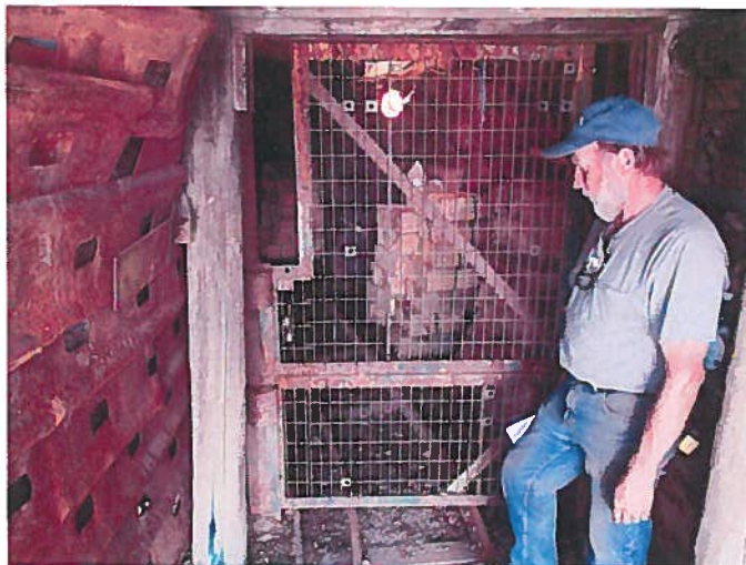
Figure 7: Tunnel No. 2