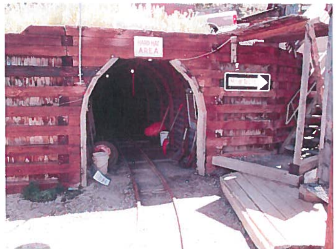
Figure 4: Clark Tunnel