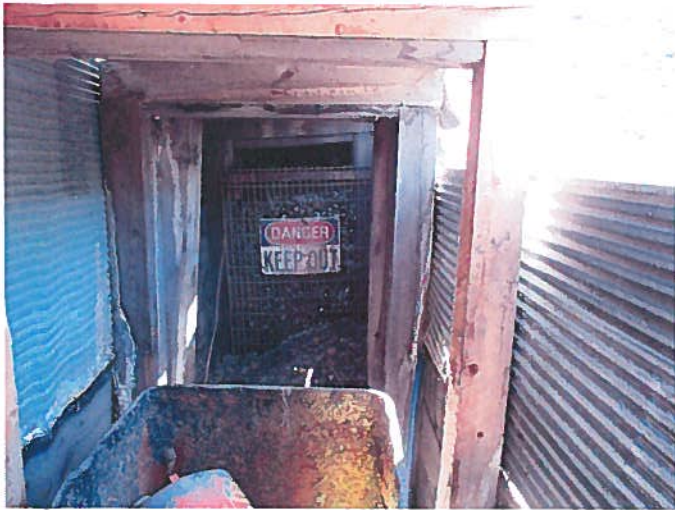
Figure 3: Tunnel No. 1A