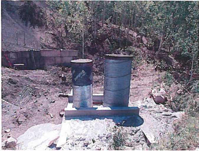
Figure 1: Smuggler Shaft