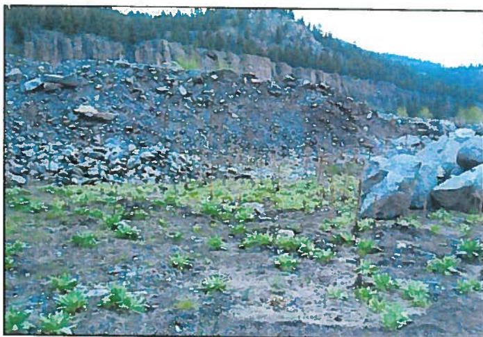
Excavation and mullein in western area