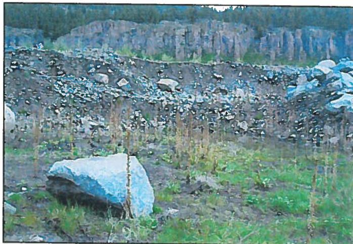
Excavation in western stockpile area, note abundance of mullein (both upper photos)