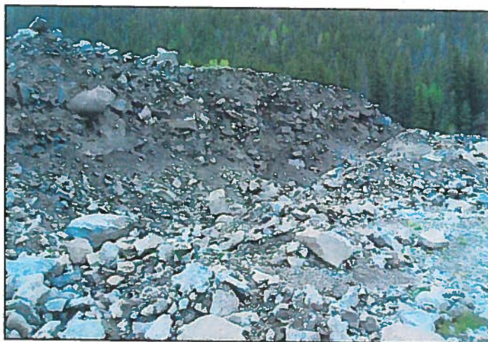
Vertical highwall in western excavation area