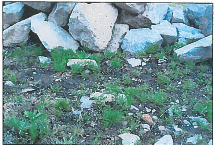
Canada thistle around rock stockpiles (both upper photos)