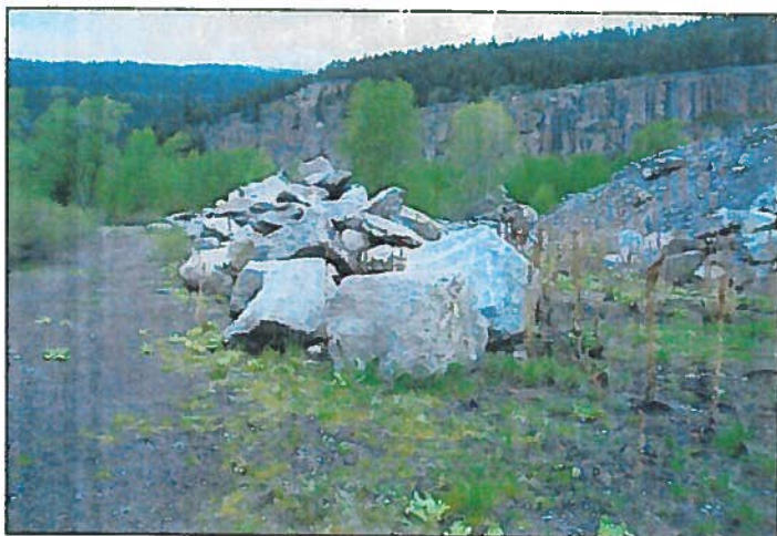
Stockpile in western area