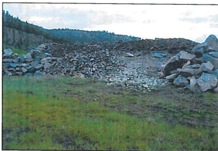
Access ramp in western excavation area