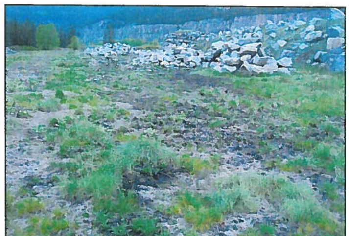
Mullein and grasses in eastern stockpile area (both lower photos)