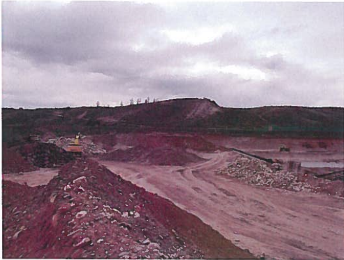
Active mining area.