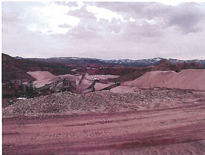
Active mining area.