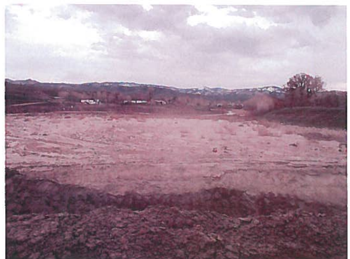
Process water cleaning pond.