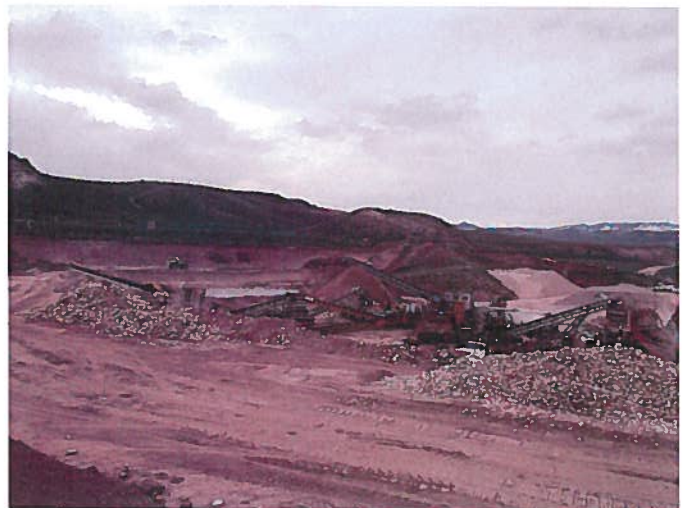
Active mining area.