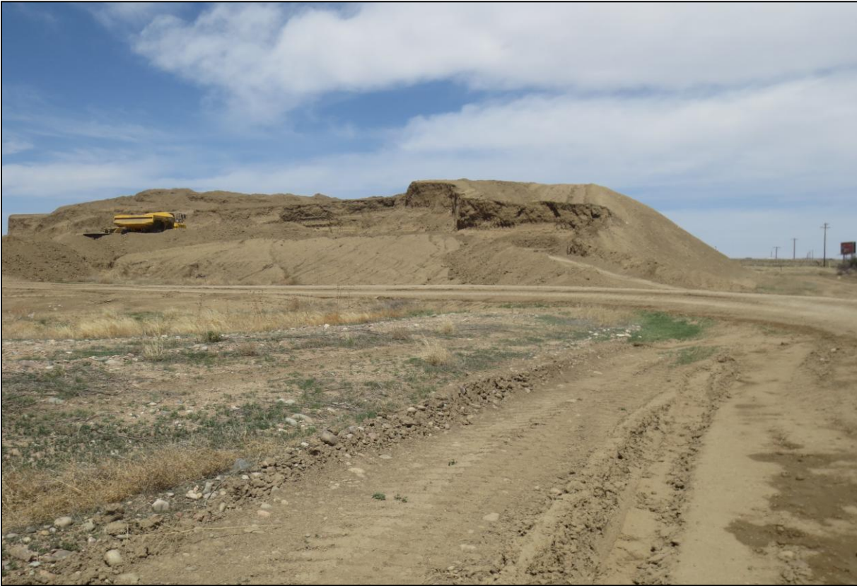
Photo 1: View looking north from the access road, eastern portion of the stockpile.