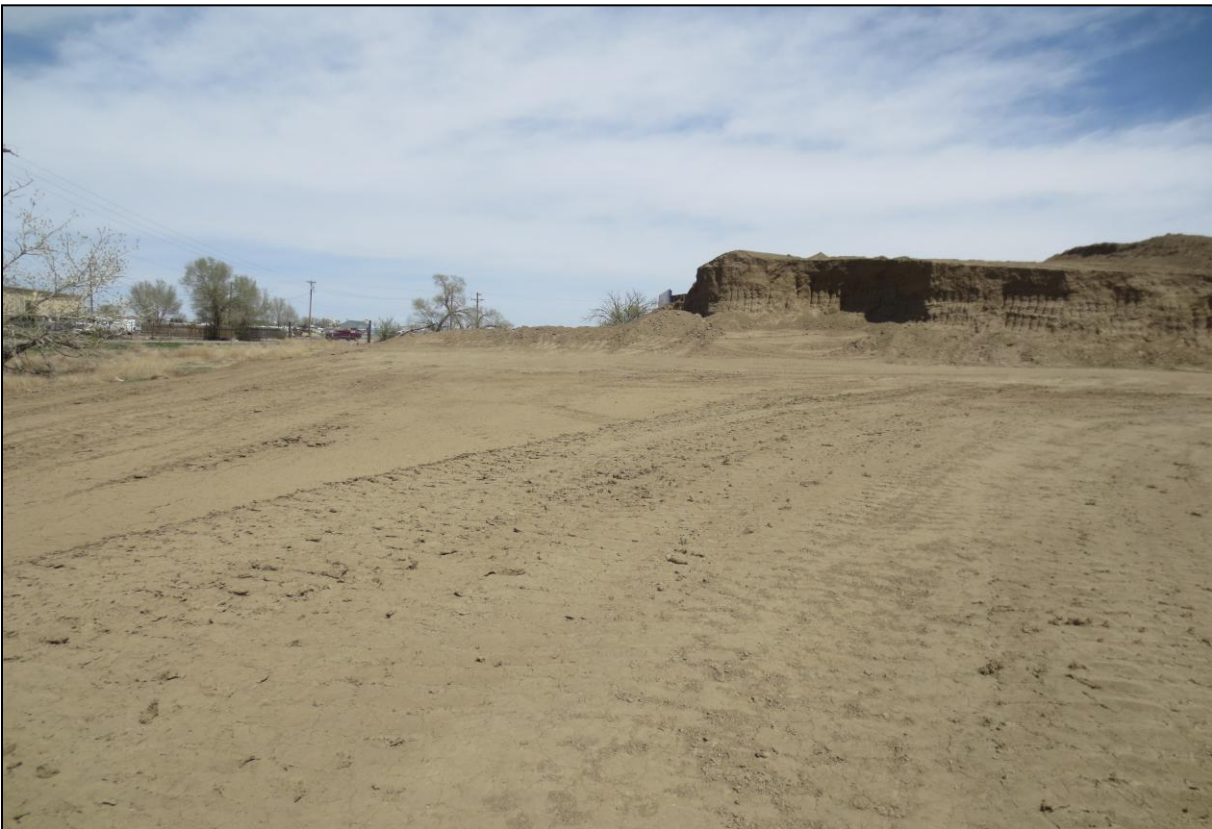
Photo 2: View looking north from the access road, western portion of the stockpile.