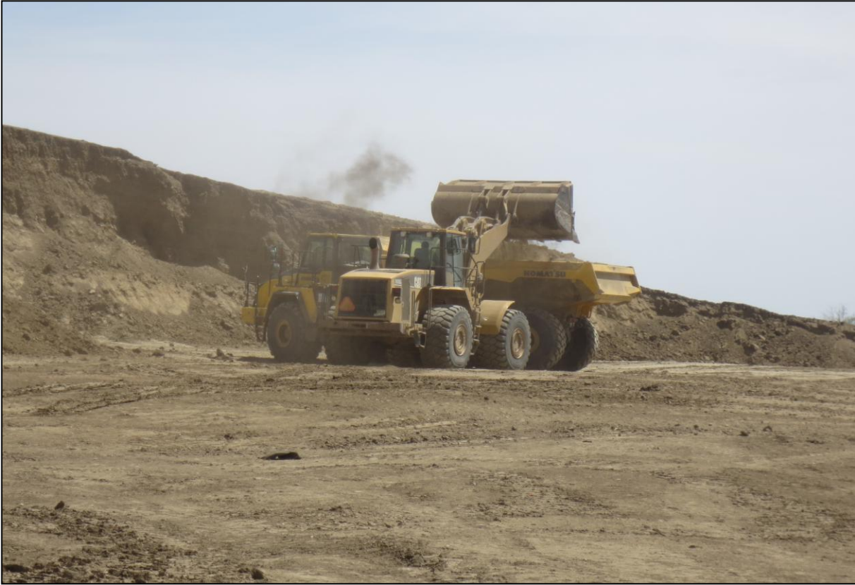
Photo 3: Truck and loader team, removing material from the stockpile.