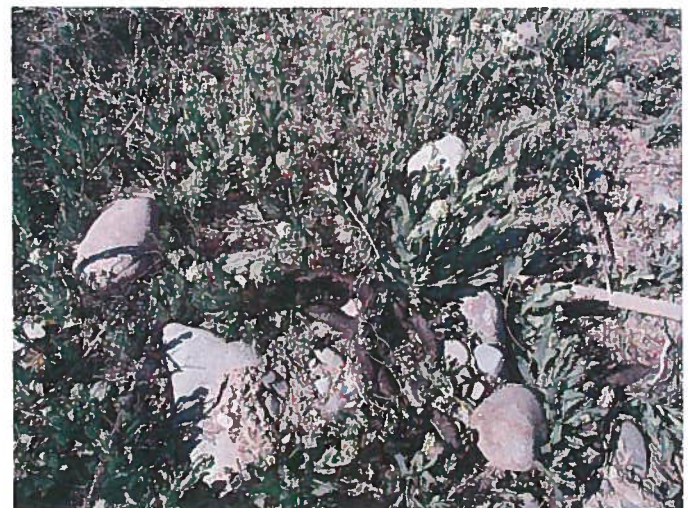
Figure 8: Hoary cress observed throughout the disturbed area.