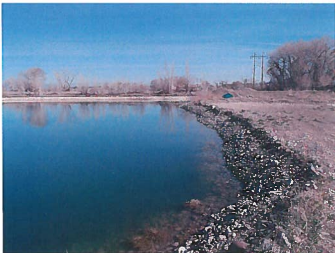
Figure 3: From the southeast side of the Phase 1 pond, facing north.