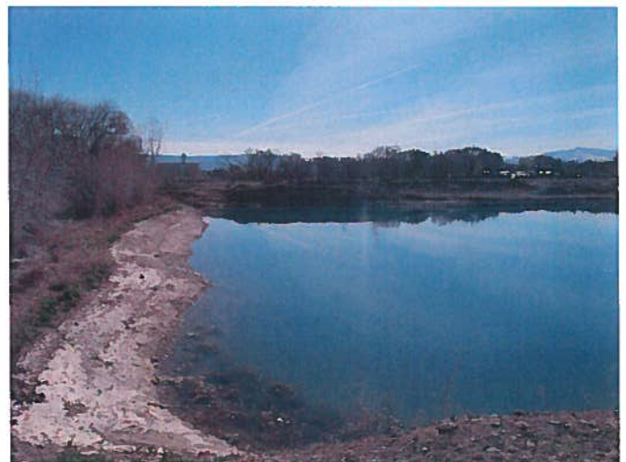
Figure 4: From the northwest side of the Phase 1 pond, facing east.