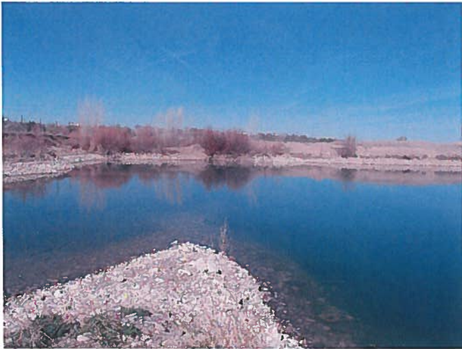
Figure 1: From the southeast side of the Phase 1 pond, facing west.