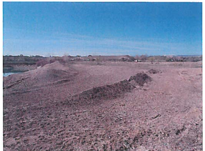
Figure 6: From the northwest side of the Phase 1 pond, facing south.