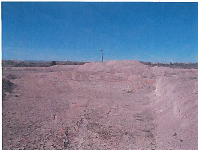
Figure 7: From the northwest side of the Phase 1 pond, facing west.