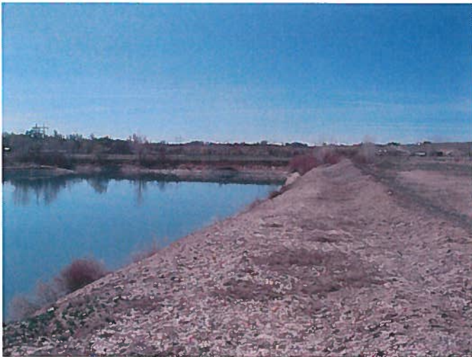
Figure 5: From the northwest side of the Phase 1 pond, facing south.