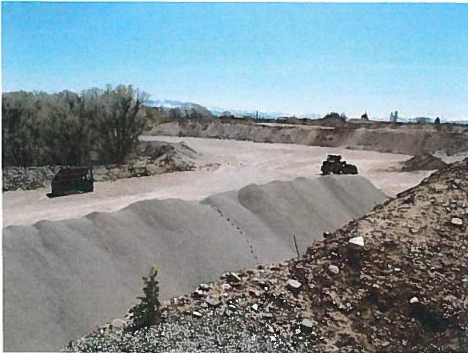
Figure 1: Phase 1 mining area