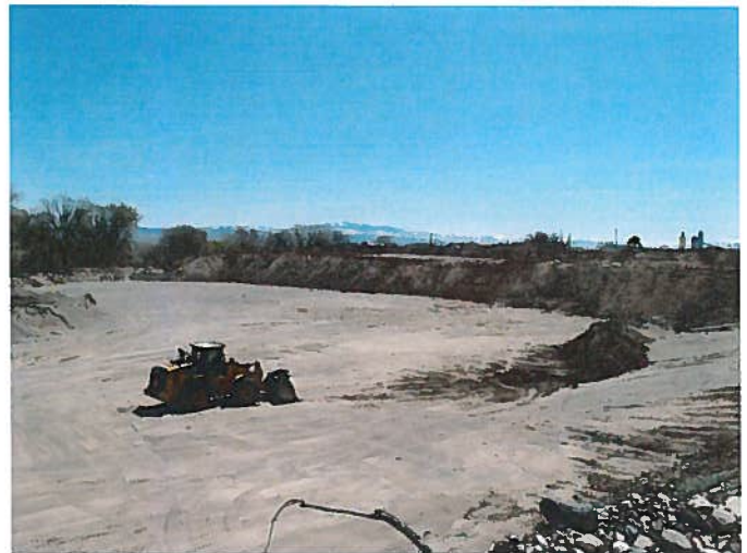
Figure 2: Phase 1 mining area