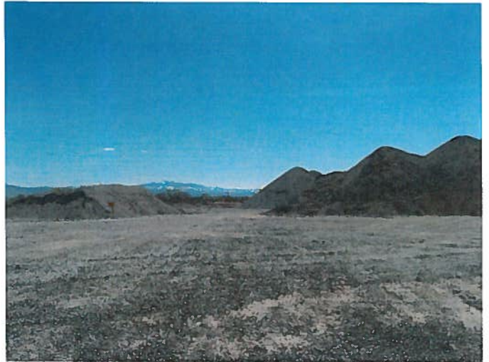
Figure 6: Phase 2 area to be mined

Norm David Montrose County 161 South Townsend Avenue Montrose, CO 81401