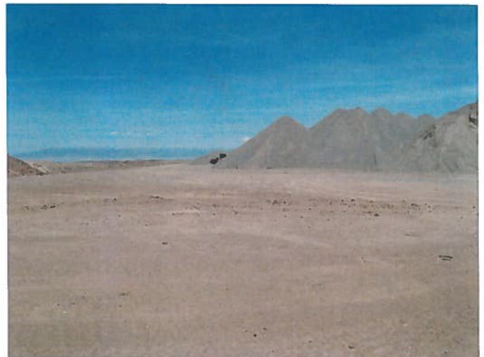
Figure 4: Southern Phase 1 area to be mined