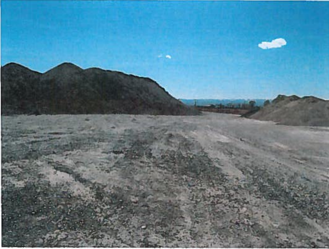
Figure 5: Phase 2 area to be mined