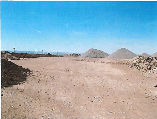
Figure 3: Southern Phase 1 area to be mined