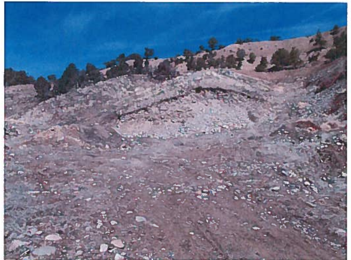
Figure 2: Proposed Phase 1 area.