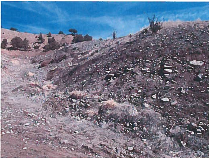
Figure 3: Proposed Phase 1 area.