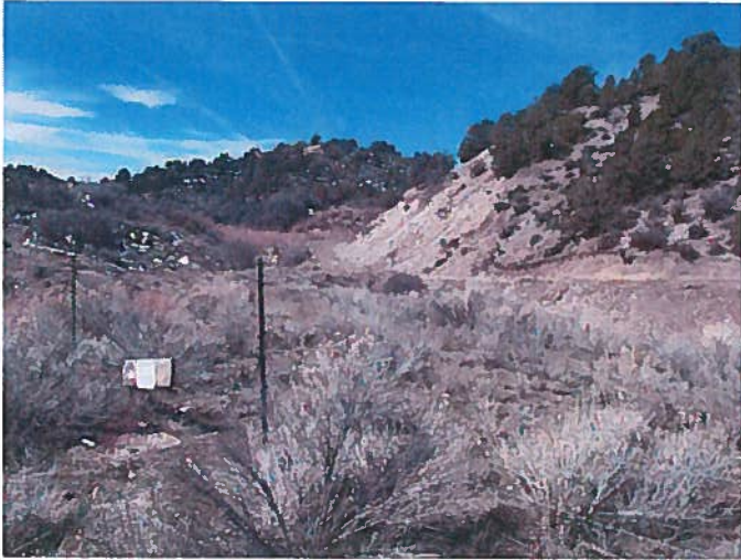
Figure 1: View of the site from Kinikin Road.