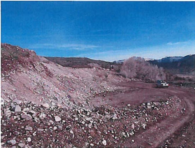
Figure 3: From south side of mined area, facing north.