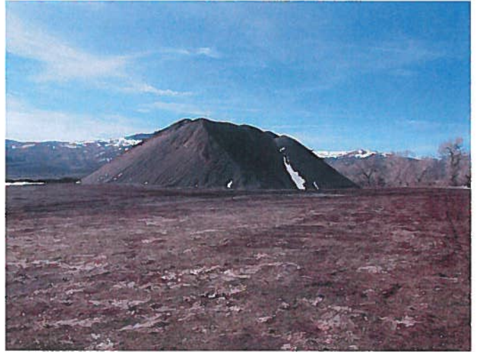
Figure 6: Upper stock pile / "to be mined" area.

Norm David Montrose County 949 N 2nd Street Montrose, CO 81401