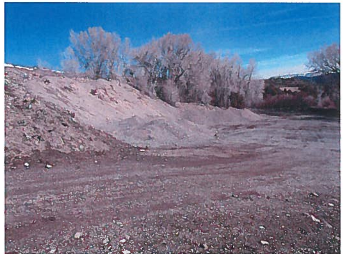
Figure 4: Lower mined/sump area.