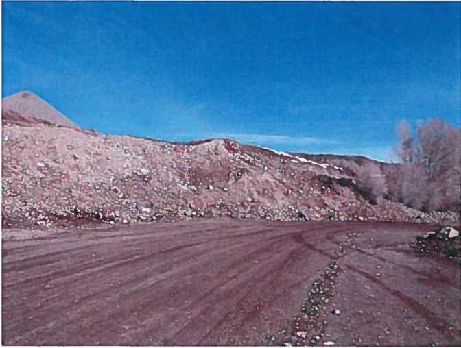
Figure 1: From central mined area, facing north.