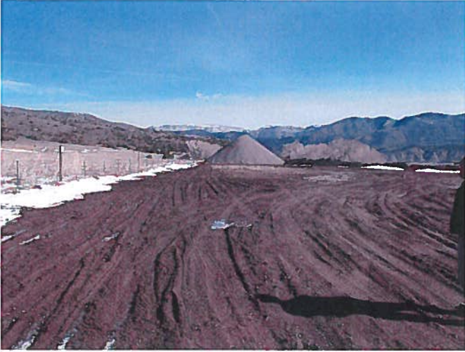
Figure 5: Upper stock pile / "to be mined" area.