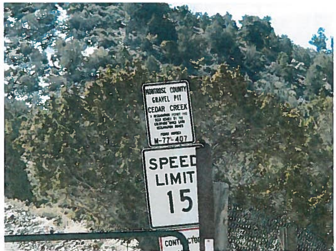
Figure 8: Site entrance

Norm David Montrose County 949 N 2nd Street Montrose, CO 81401