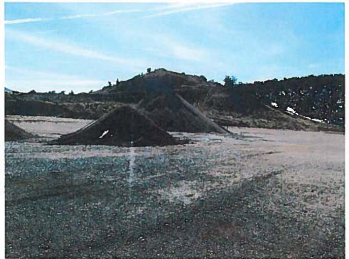
Figure 4: View towards southeast part of Phase 1a