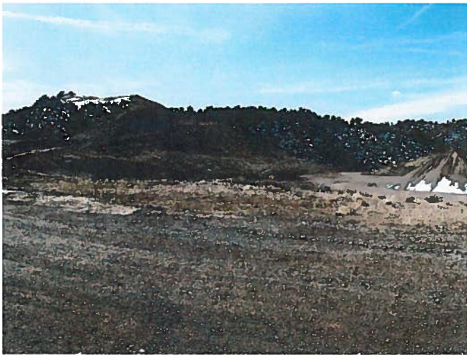
Figure 7: Overburden removal occurred on top of ridge in Phase 1c area.