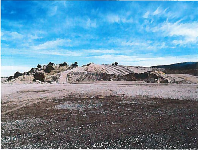
Figure 1: View towards north part of Phase 1a