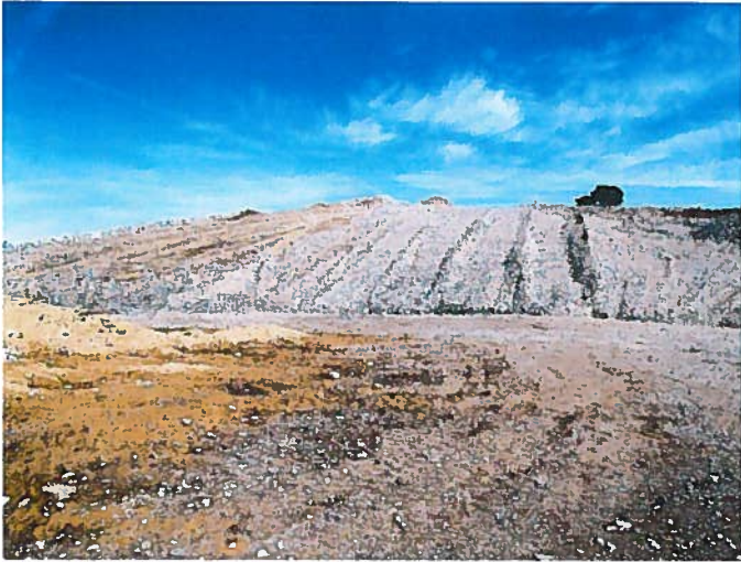
Figure 5: Mined slope in north part of Phase 1a