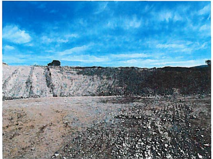
Figure 6: Mined slope in north part of Phase 1a