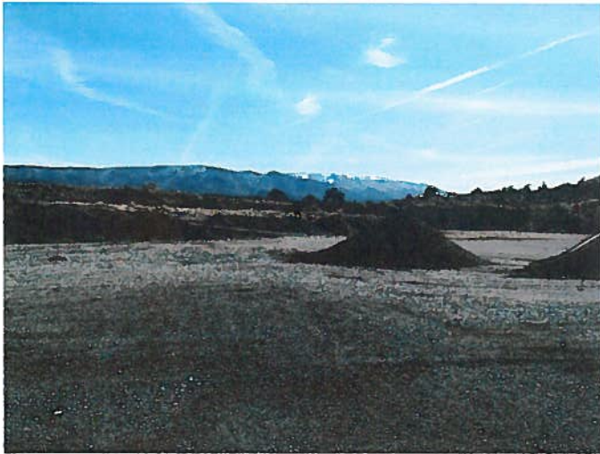
Figure 3: View towards east part of Phase 1a