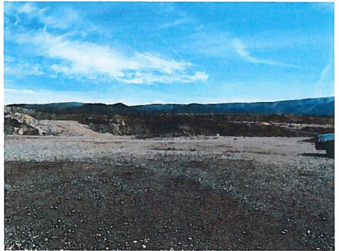
Figure 2: View towards north part of Phase 1a