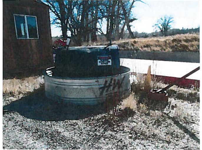
Figure 2: Fuel storage behind scale house.