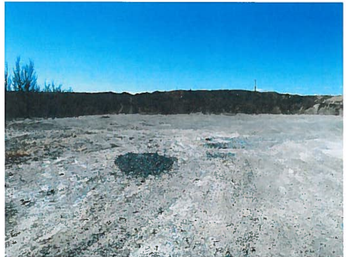
Figure 4: View from pit entrance, facing south.