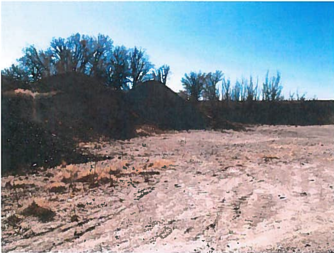
Figure 3: View from pit entrance, facing south.