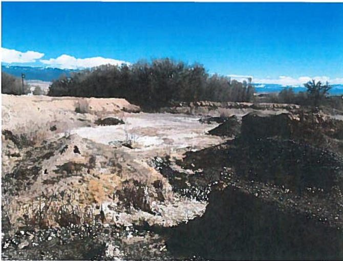
Figure 7: View of low area in pit floor, which was dry during this inspection.