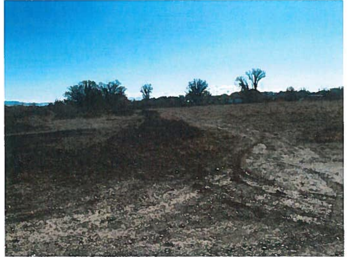
Figure 10: Unmined area on south side of pit.

Jason Rinderle Upland Gravel, Inc. 3202 Springfield Road Grand Junction, CO 81503