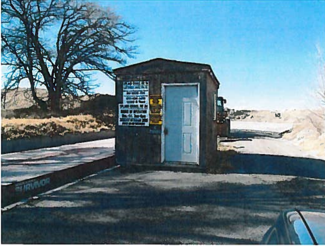
Figure 1: Scale house at site entrance.