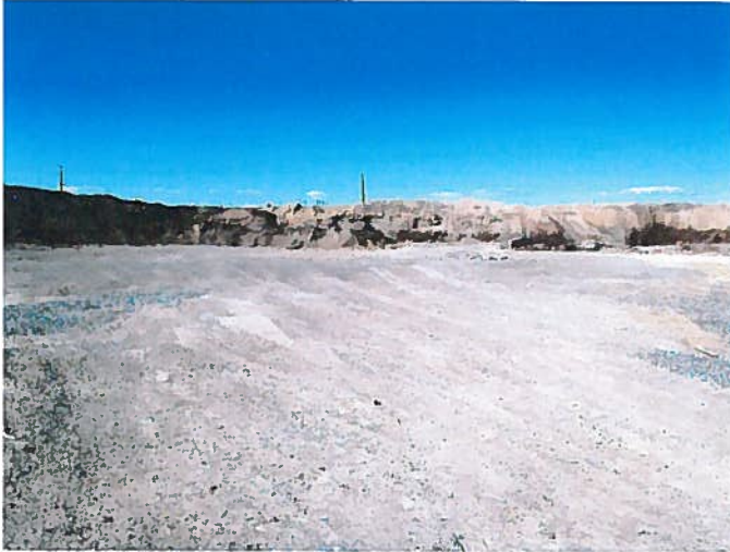
Figure 5: View from pit entrance, facing southwest.