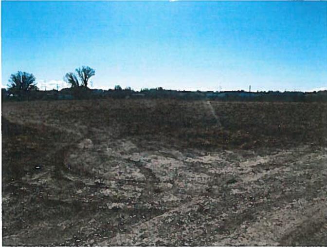
Figure 9: Unmined area on south side of pit.