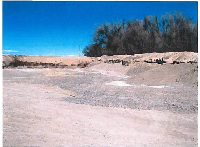
Figure 6: View from pit entrance, facing west.