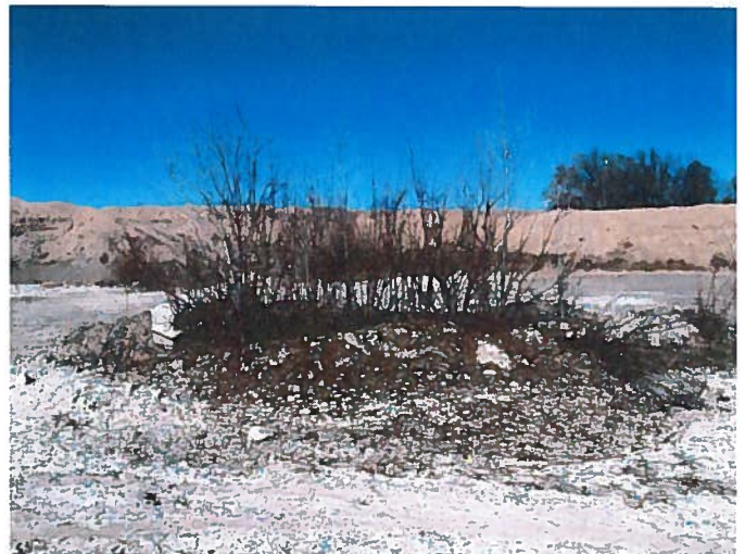
Figure 8: Tamarisk beginning to establish in low areas of pit floor that hold water during irrigation season.