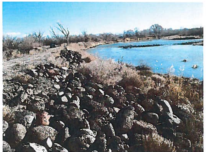
Figure 4: River bank stabilization adjacent to pond.