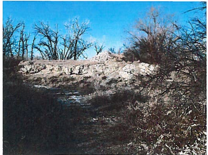
Figure 6: Soil pile on west side of pond.