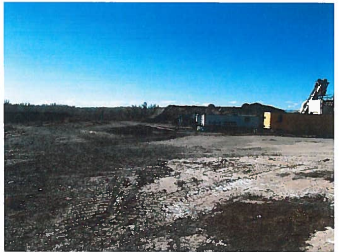
Figure 2: Operation and stockpile area.