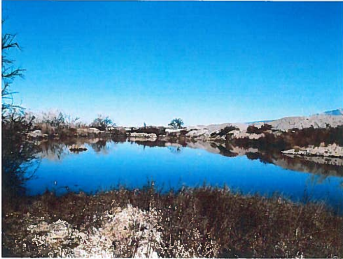
Figure 5: Mined area.