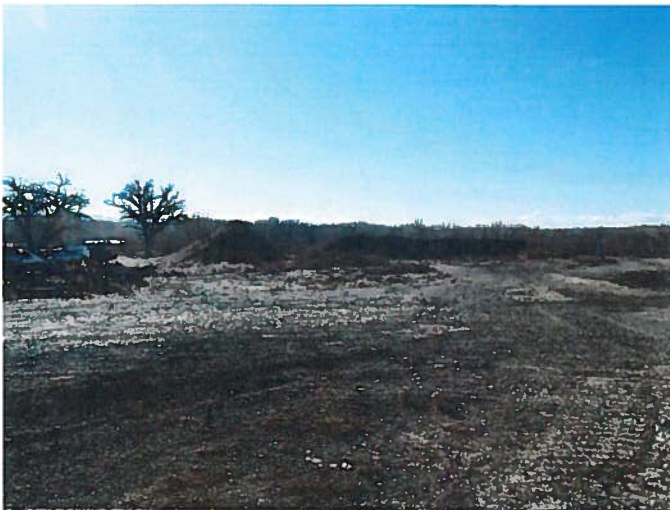
Figure 3: Operation and stockpile area.