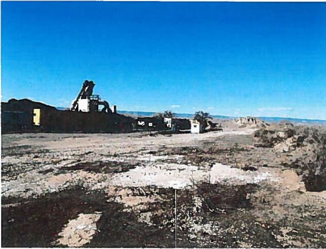
Figure 1: Operation and stockpile area.