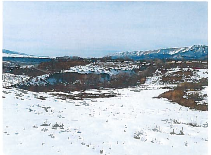
Looking west from top bench