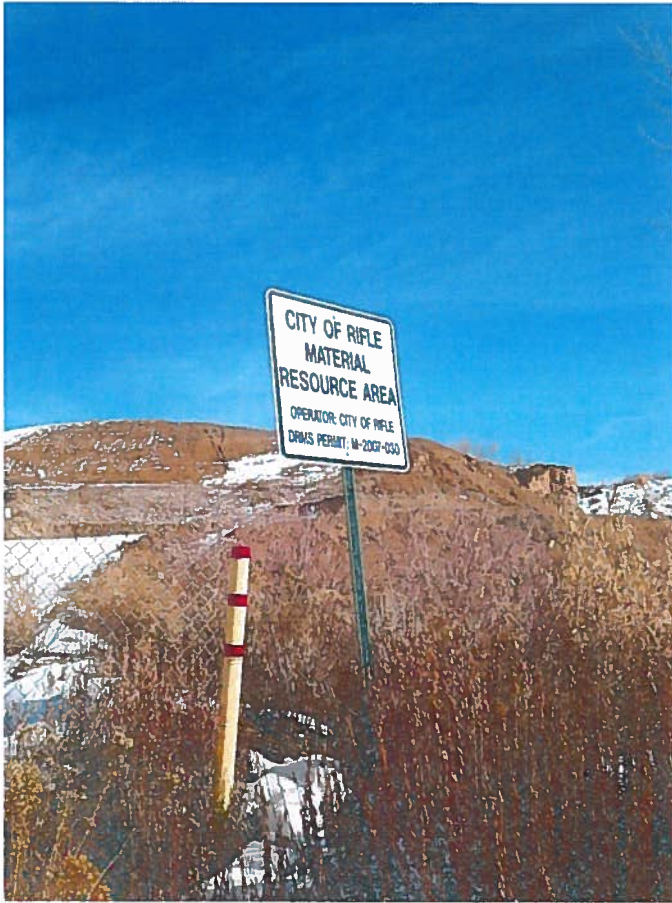
Mine Identification Sign