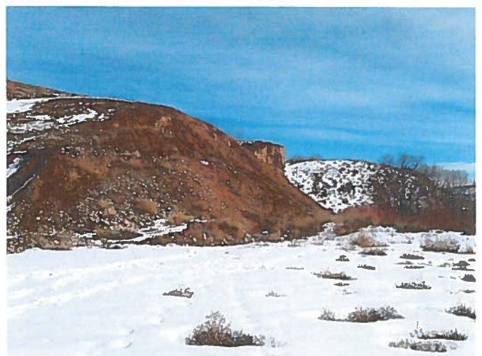
Borrow area looking east with Kochia