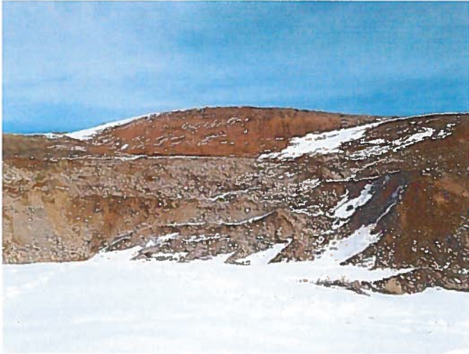
Borrow Area with graded slope above