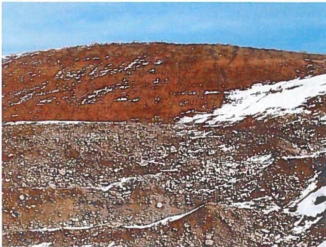
Closeup of rilling and gullies forming