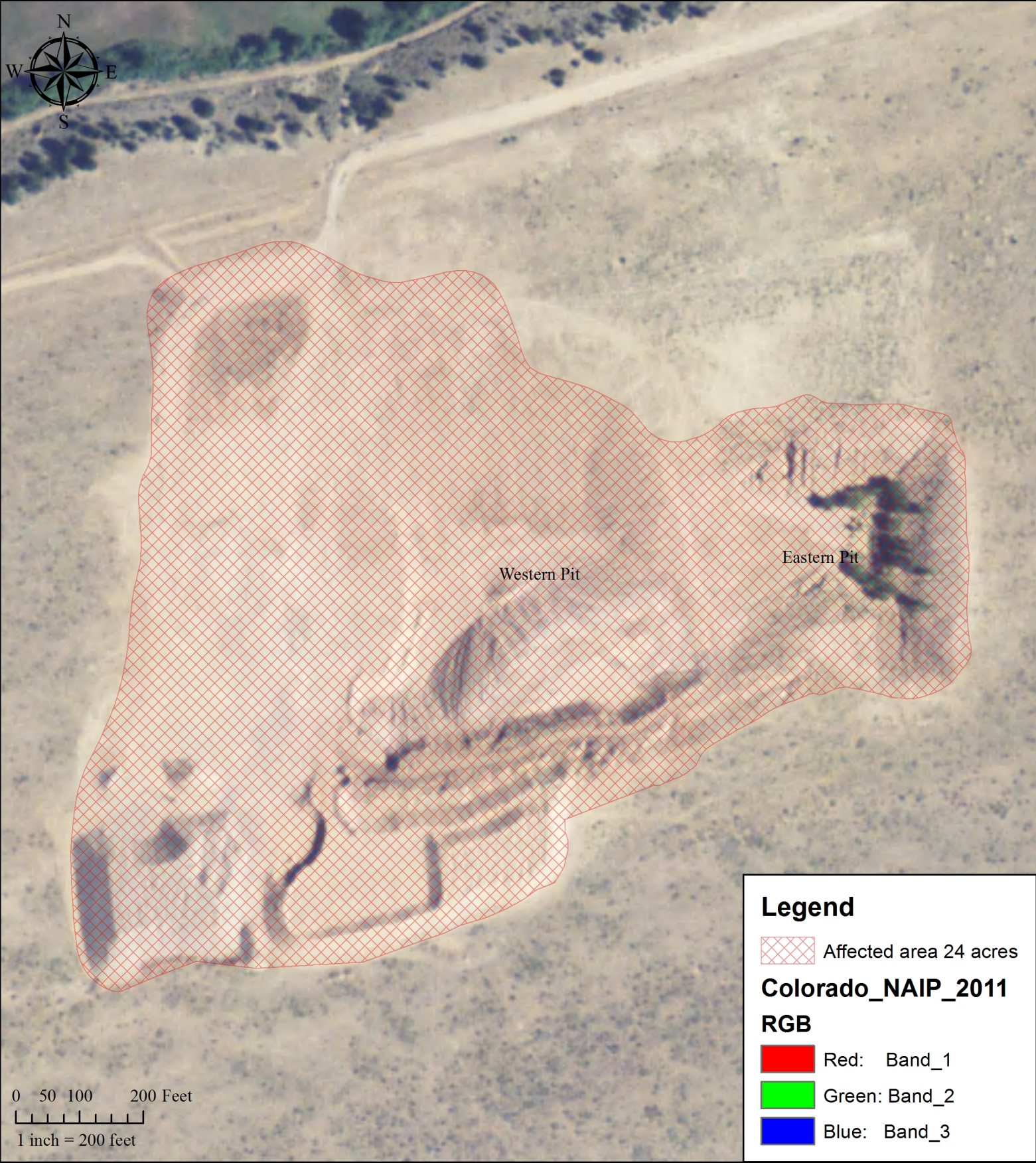
Figure 1: Affected area boundary (marked by the red lines on this 2011 NAIP image) encloses approximately 24 acres.