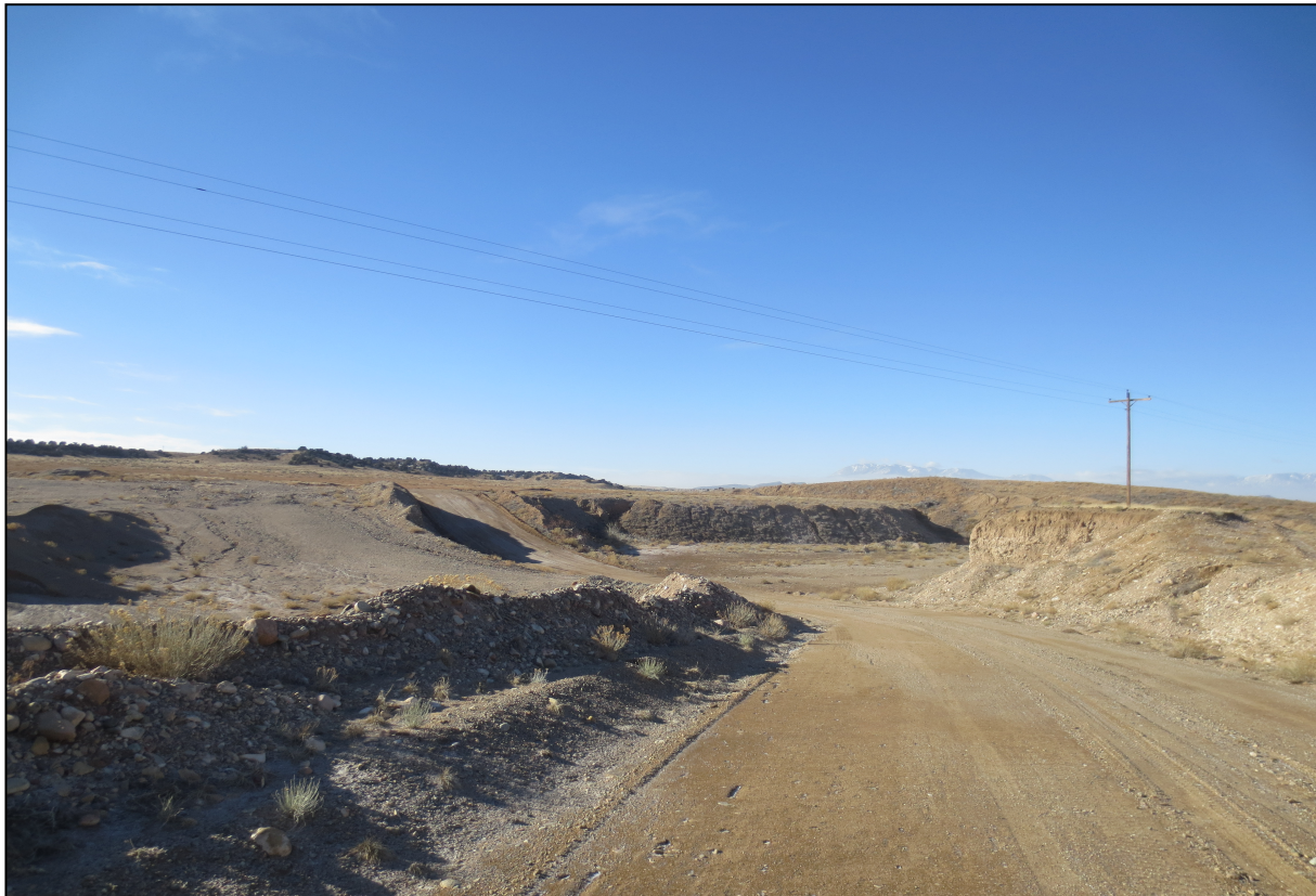
Photo 2: View looking southwest into the pit from the access road.