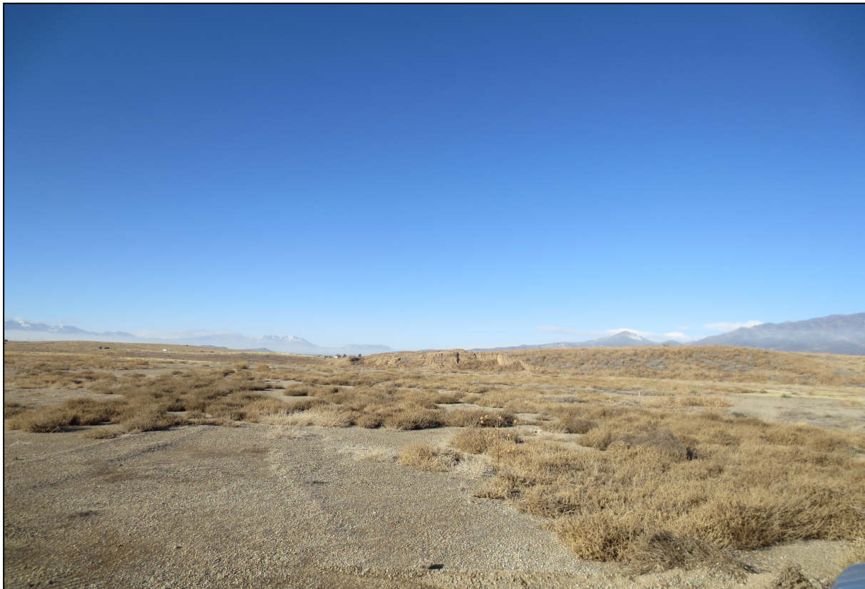
Photo 4: View looking west, pad where the processing plant was, and topsoil stockpile in the background.