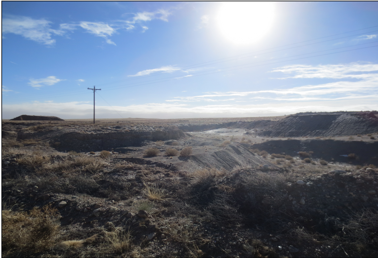
Photo 1: View looking southeast into the pit from the access road.