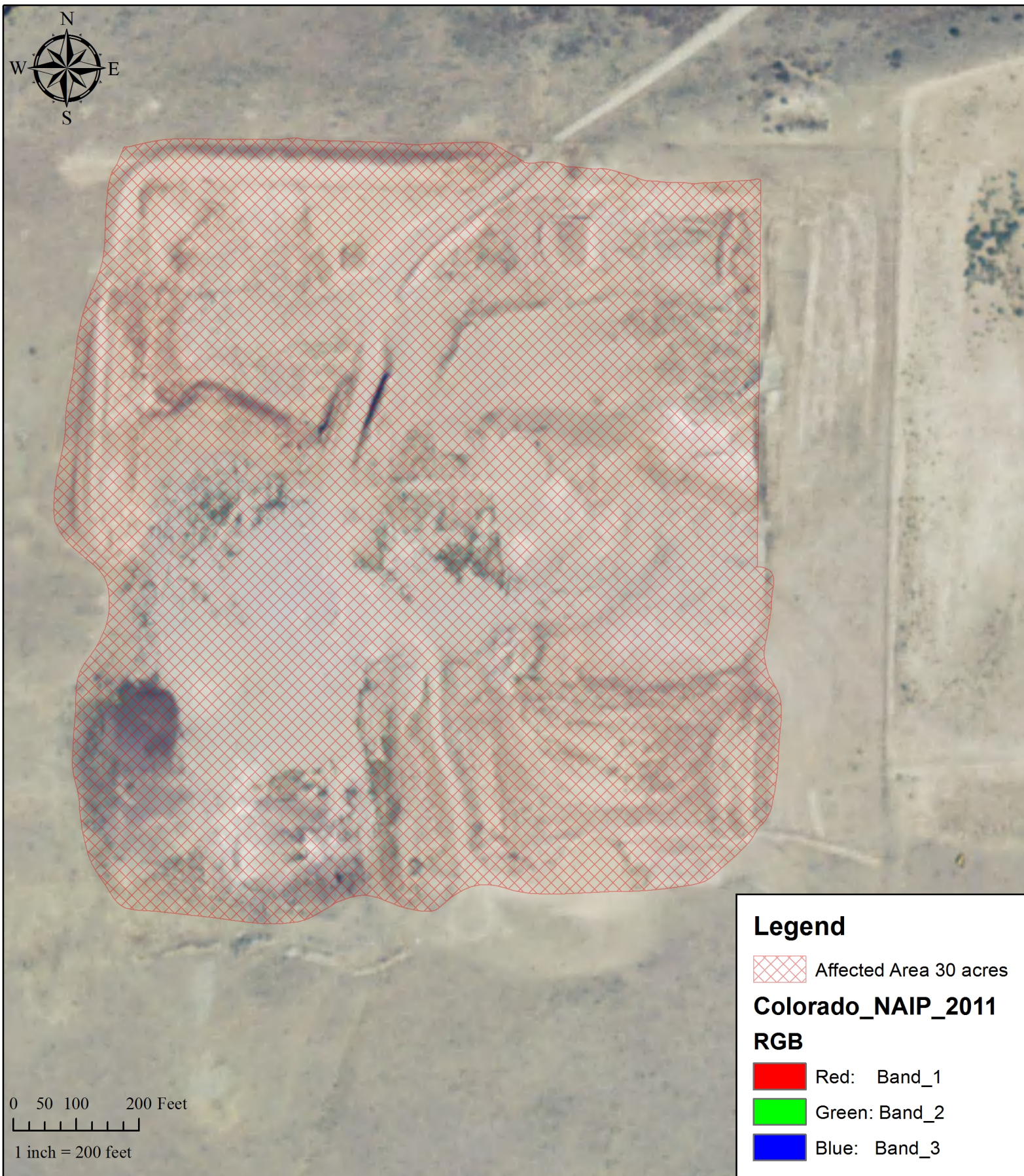
Figure 1: Affected area boundary (marked by the red lines on this 2011 NAIP image) encloses approximately 30 acres.