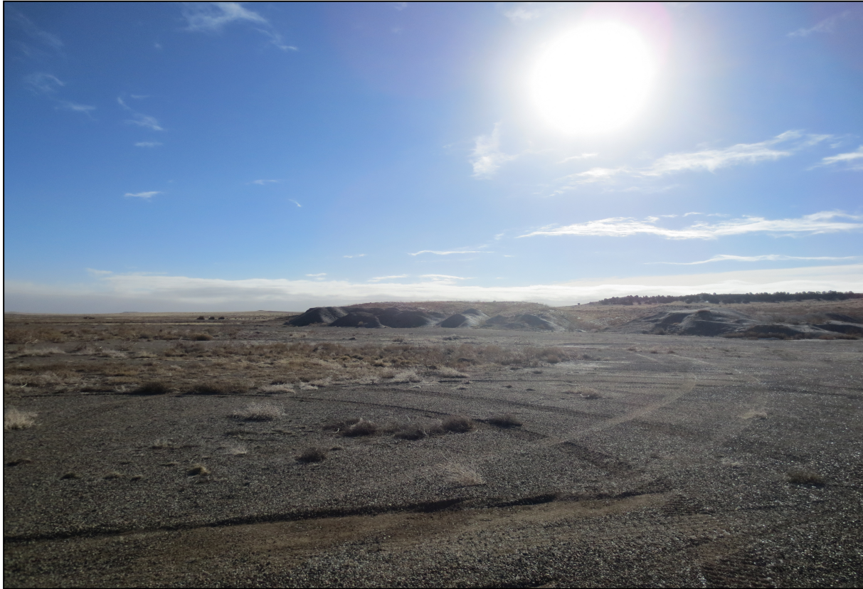
Photo 3: View looking southeast, where the processing plant was, and product stockpile in the background.