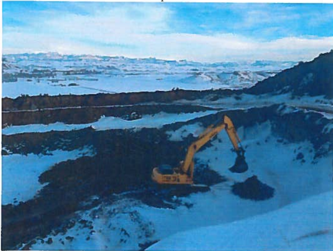
Excavation of pit