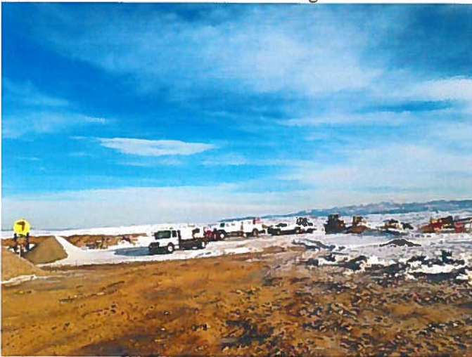
Portable Fuel Truck