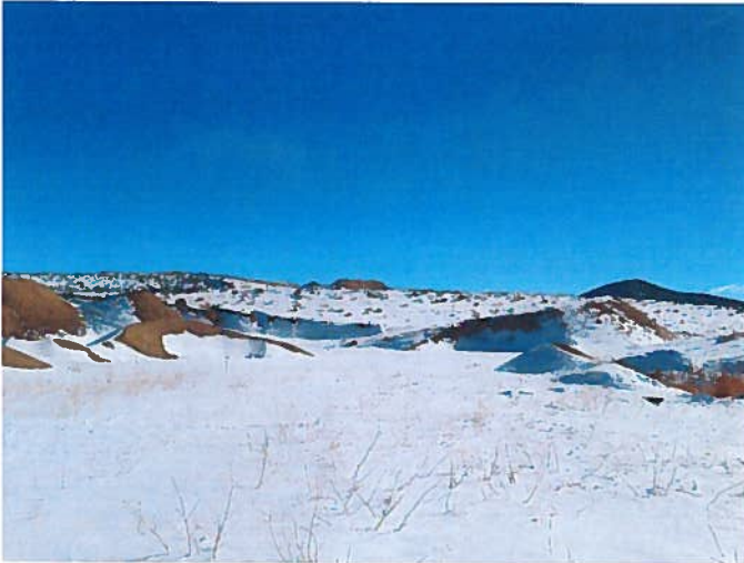
Area (background) to the South, reclaimed