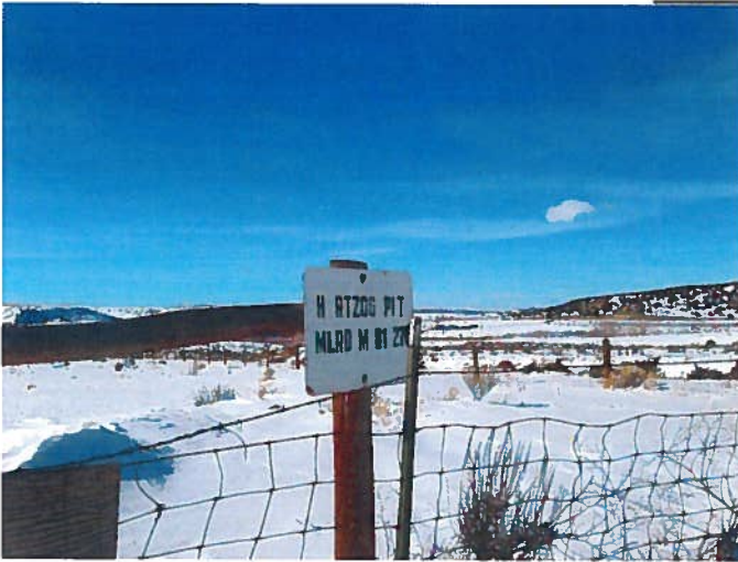
Mine Identification Sign