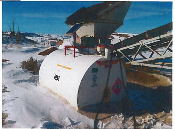
Fuel with adequate berm