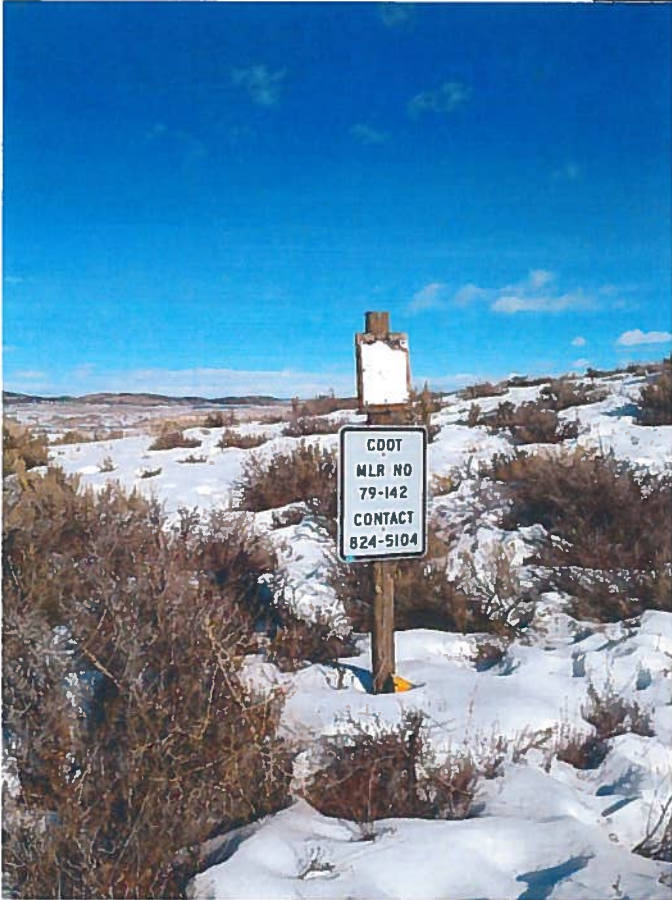
Permit Identification Sign