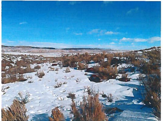
Culverts and trash on site