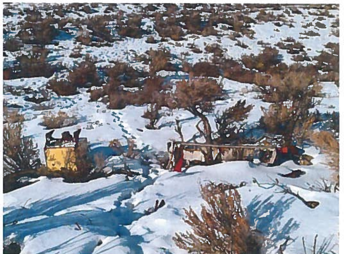
Trash- stove and box spring