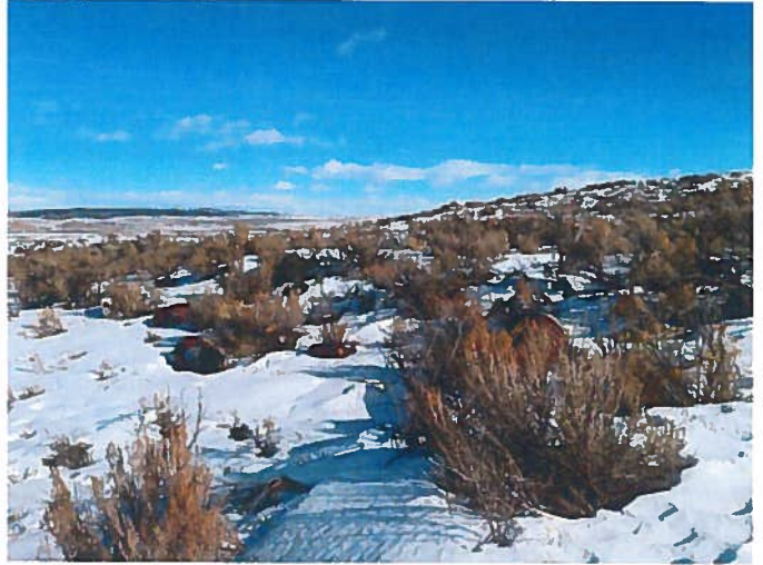
Trash & Refuse on Site