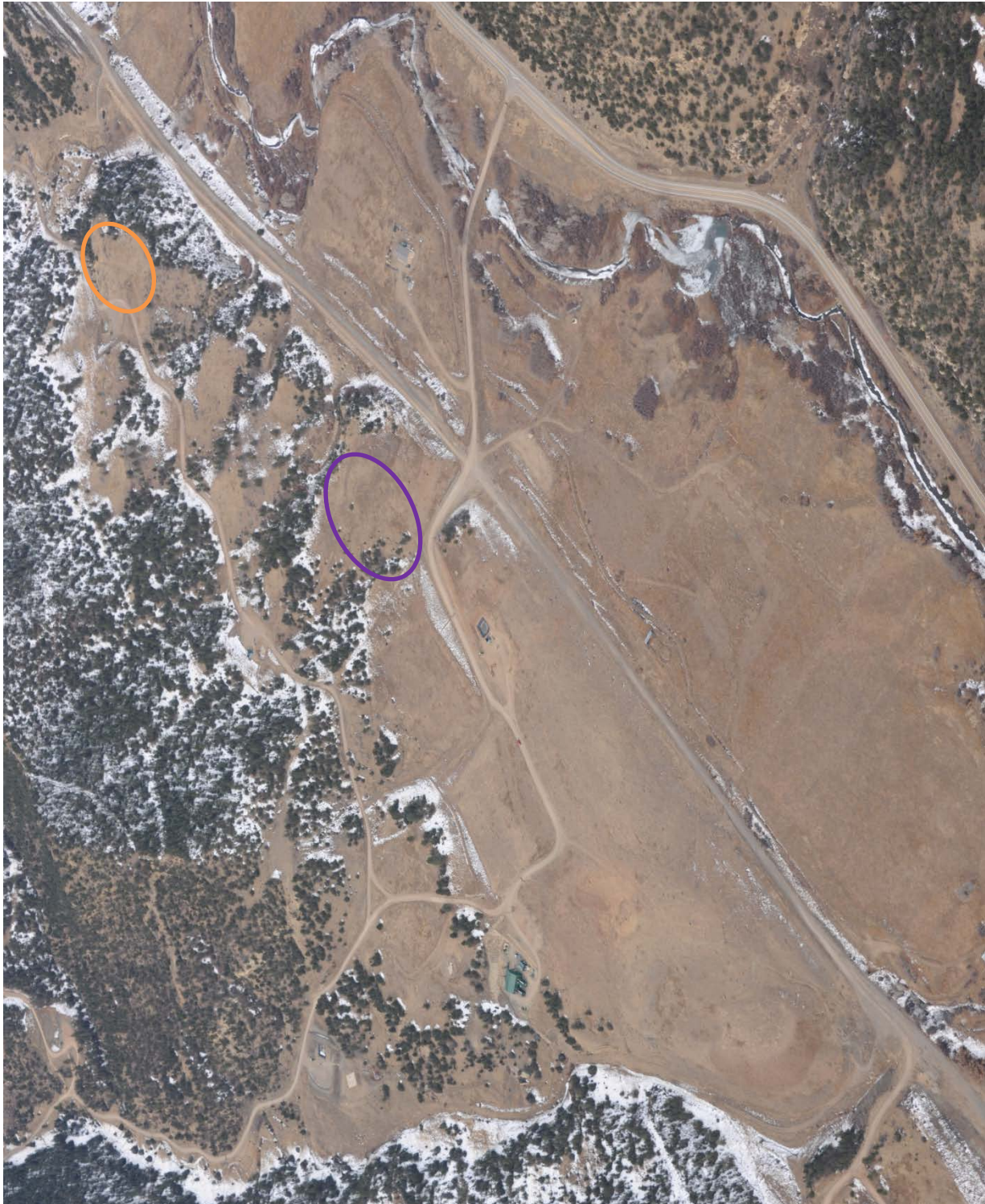
Photo 1: The vegetation reference areas; grassland - purple; upland - orange

Number of Partial Inspection this Fiscal Year: 4