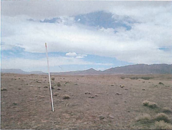
Photo 3. Southern boundary marker.