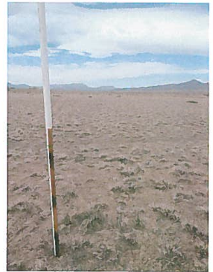
Photo 2. Typical T-post w/ extension.