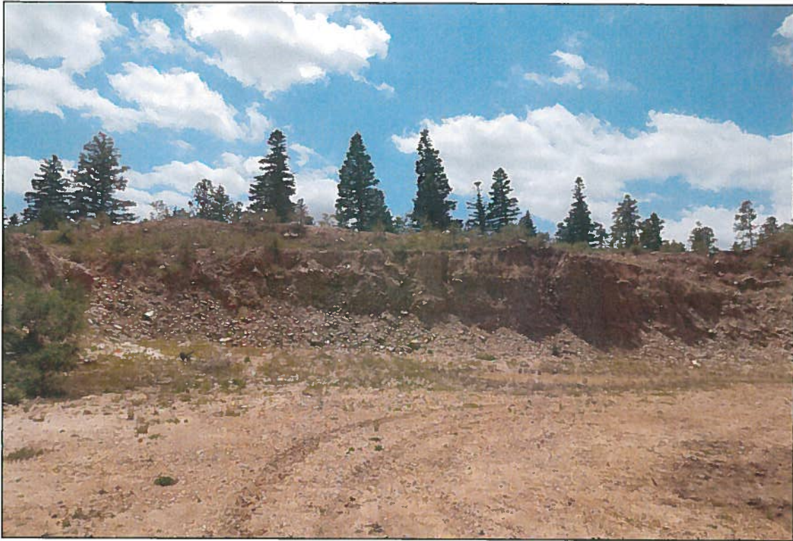
Photo 1: View looking south, mining highwall in the background with erosion features.