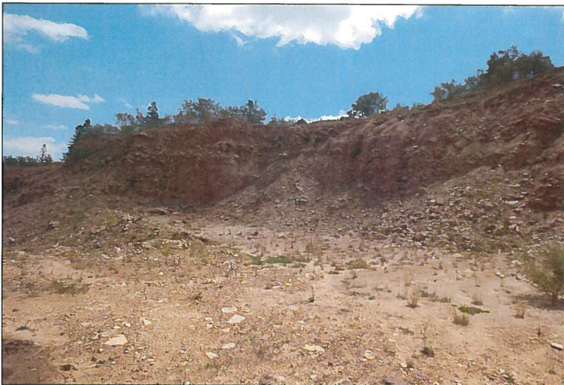
Photo 2: View looking southeast, mining highwall in the background with erosion features.