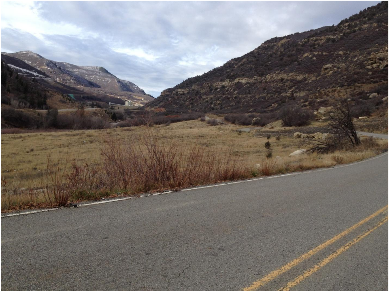
East Mine facilities area

Number of Partial Inspection this Fiscal Year: 1