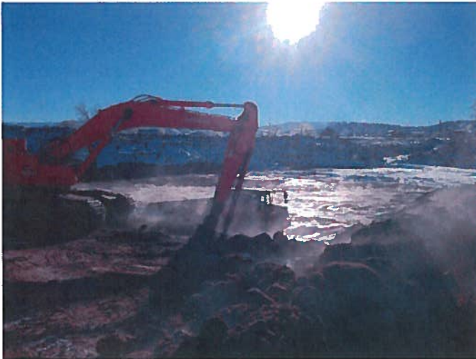
Phase 2 Mining