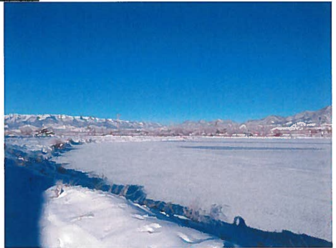
Phase 1 pond, reclaimed