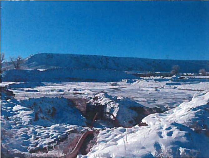
Pump in Phase 2 mining area