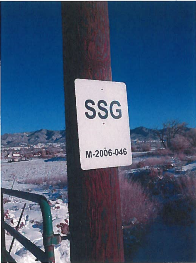
Inadequate Mine Identification Sign