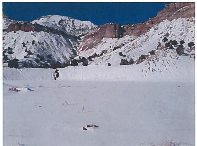
Rilling starting on north area of permit