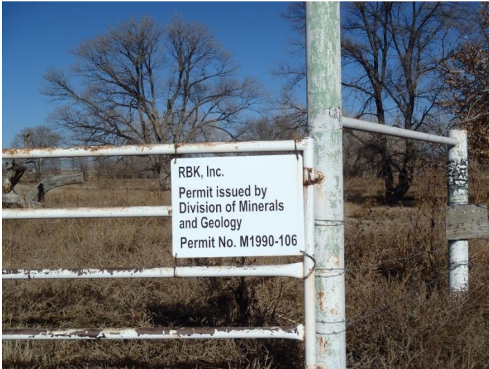
Photo 1. Required permit sign.