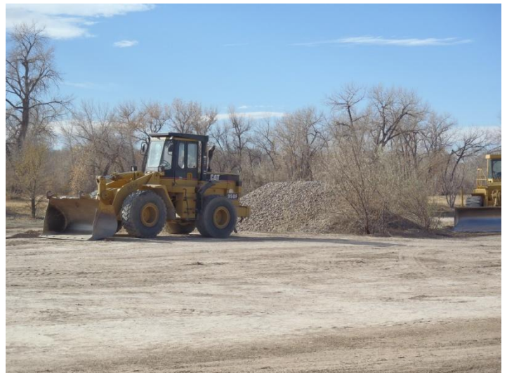
Photo 6. Loader, dozer and small material stockpile.