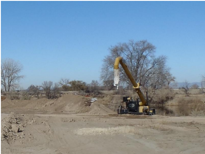
Photo 5. Portable J-stand w/ submersible pump.