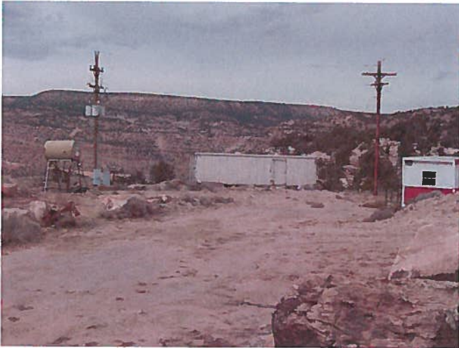
Figure 1: Operations area above Wright Portal.