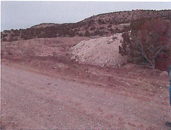
Figure 3: Waste dump area.