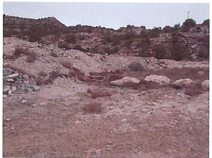
Figure 4: Waste dump area.