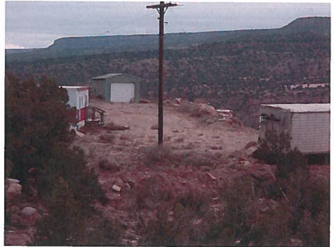
Figure 2: Operations area above Wright Portal.