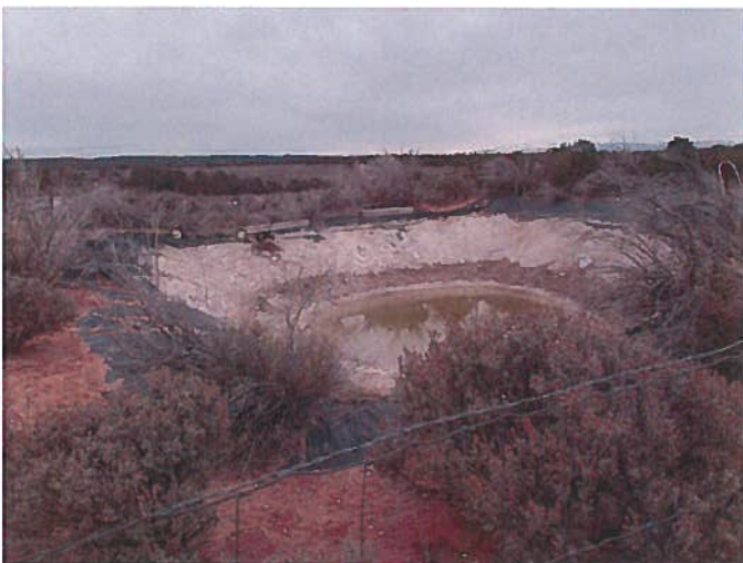
Figure 7: Upper Monogram treatment pond (central).