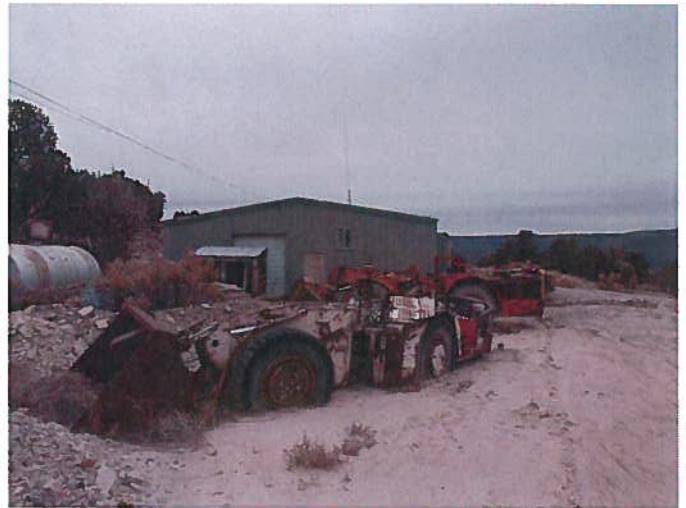
Figure 2: Bull Canyon area mine bench/operations area.