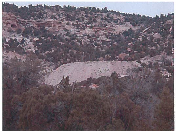
Figure 4: Bull Canyon area waste rock pile.