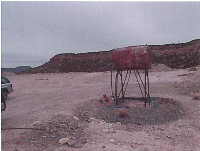
Figure 3: Bull Canyon area mine bench/operations area.