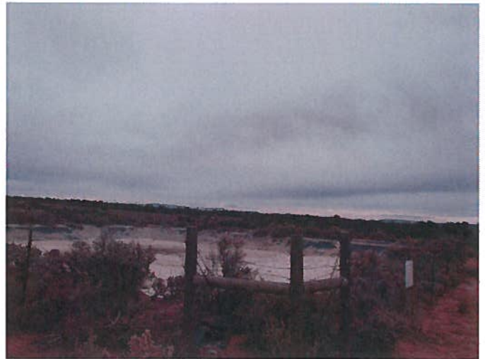
Figure 6: Upper Monogram treatment pond (easternmost).