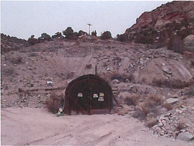
Figure 1: Collapsed portal in Bull Canyon area.