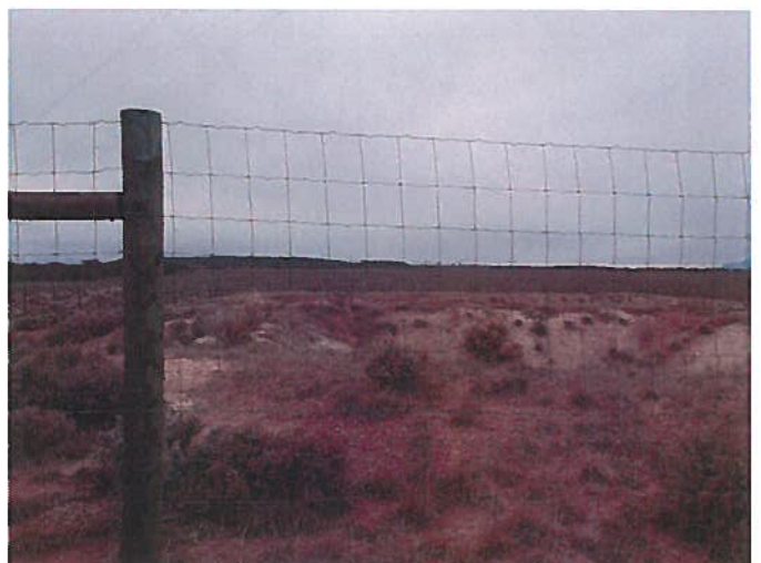
Figure 8: Upper Monogram treatment pond (westernmost).