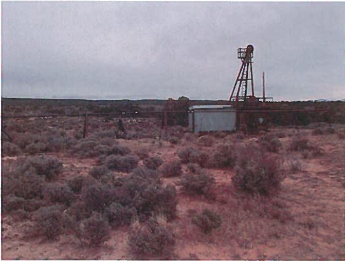
Figure 5: Upper Monogram area.