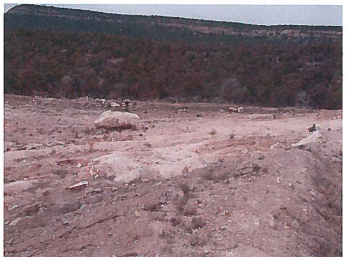
Figure 4: Sediment retention pond on south side of waste dump/mine bench.