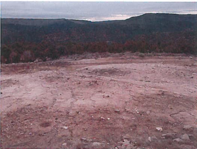
Figure 3: Sediment retention pond on south side of waste dump/mine bench.