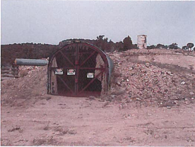
Figure 1: SR-11 Portal