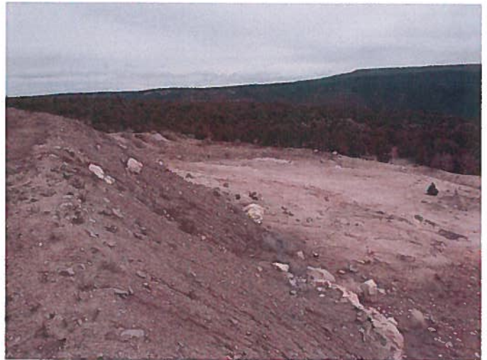
Figure 2: Sediment retention pond on south side of waste dump/mine bench.