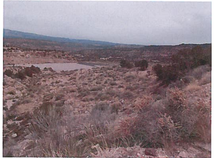
Figure 2: Looking east toward waste dump area.

Glen Williams Cotter Corporation P.O. Box 700 Nucla, CO 81424