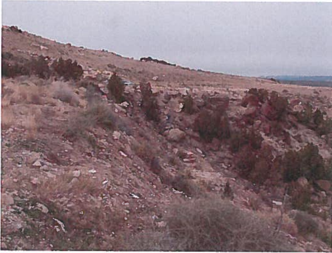
Figure 1: Looking north toward portal area.