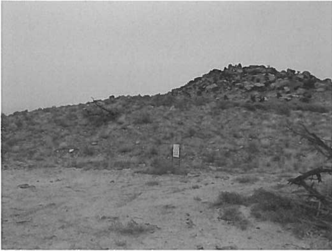
Figure 1: View toward the reclaimed waste pile.