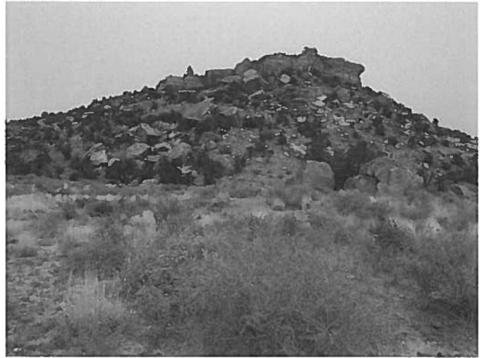
Figure 2: View toward the reclaimed portal.