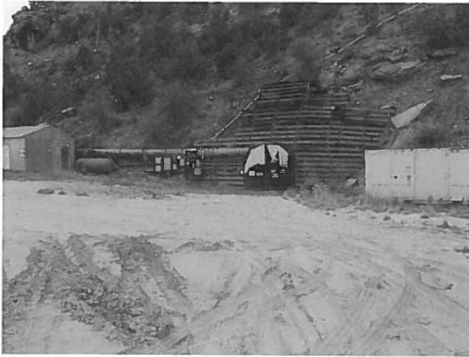
Figure 1: JD-8 portal