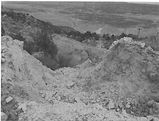
Figure 3: Erosion occurred during fall precipitation event above west retention pond.