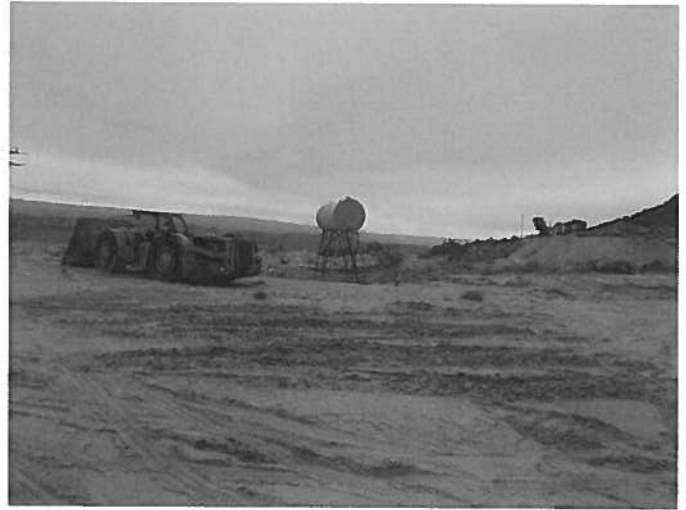
Figure 2: Operations area on mine bench.