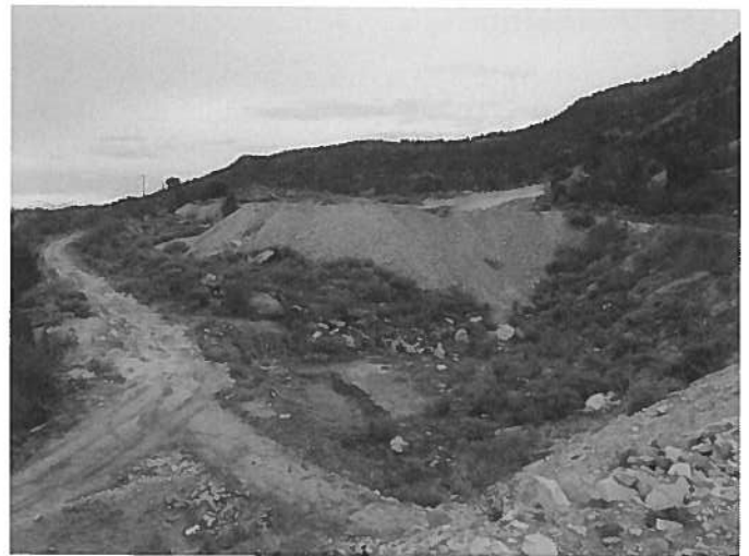
Figure 4: Sediment retention pond on east side of mine bench.