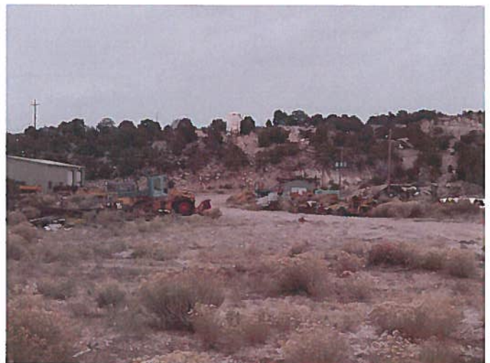
Figure 8: Shop area.