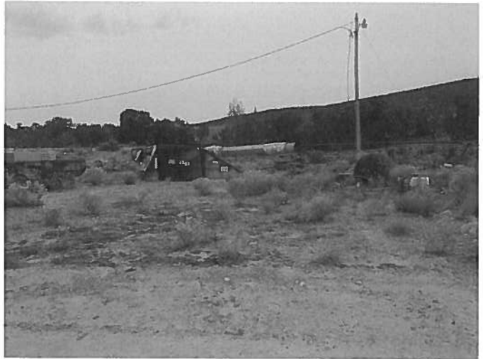
Figure 2: JD-7 underground portal area.