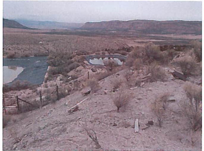
Figure 6: Retention ponds.