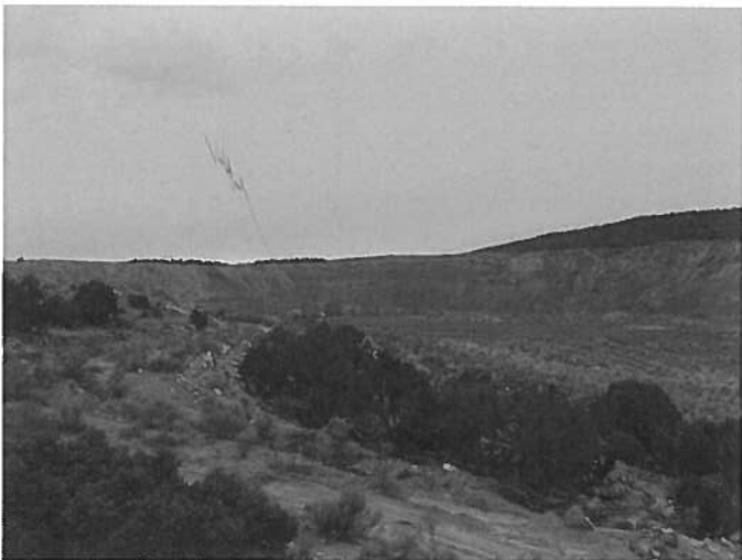
Figure 3: View towards the highwall from the northwest end of the pit.