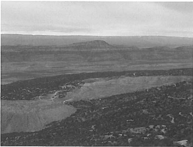
Figure 1: View facing north toward the site, from DD19 Road. Waste dump is shown in the left, and the pit area in the right.