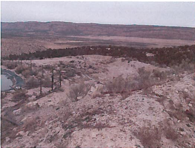
Figure 7: Retention ponds.