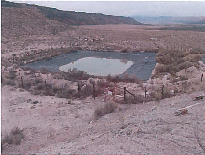
Figure 5: Retention ponds.