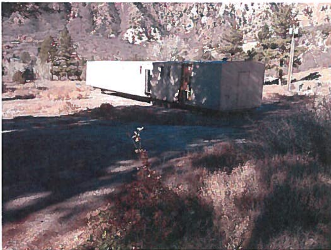
Figure 3: Bathhouse staged for removal in parking/staging area on south side of FR 310.