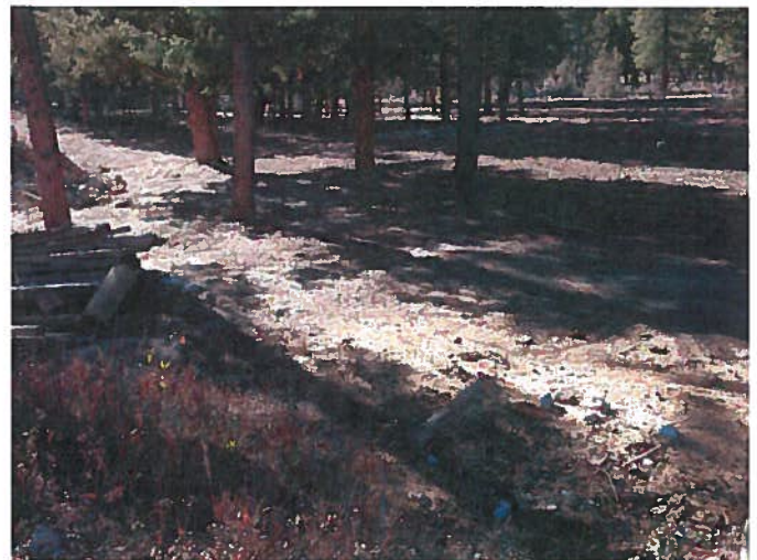
Figure 4: Prior location of bathhouse cleaned up.