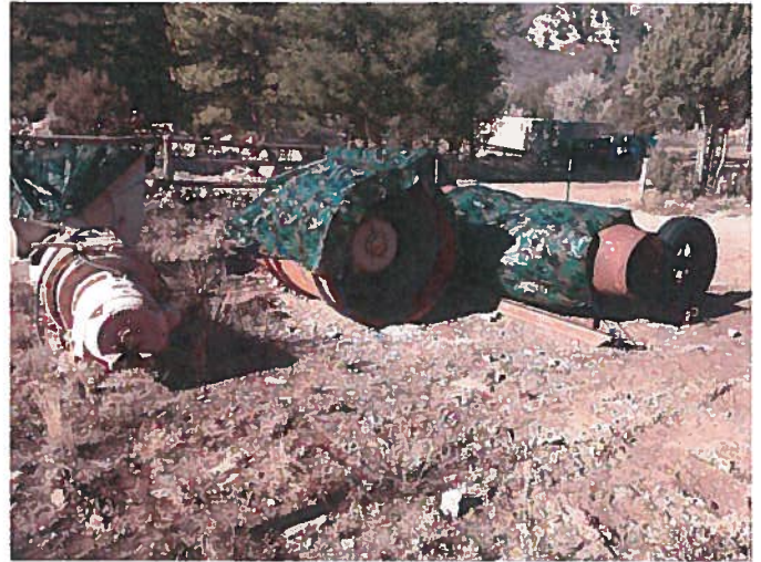
Figure 2: Equipment considered necessary for the mining operation stored on north side of FR 310.