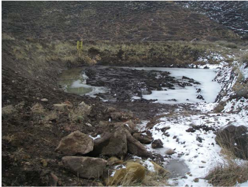
Prospect Pond, from inlet