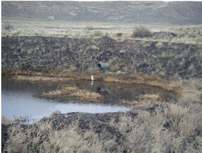
Gossard Pond spillways

Number of Partial Inspection this Fiscal Year: 6