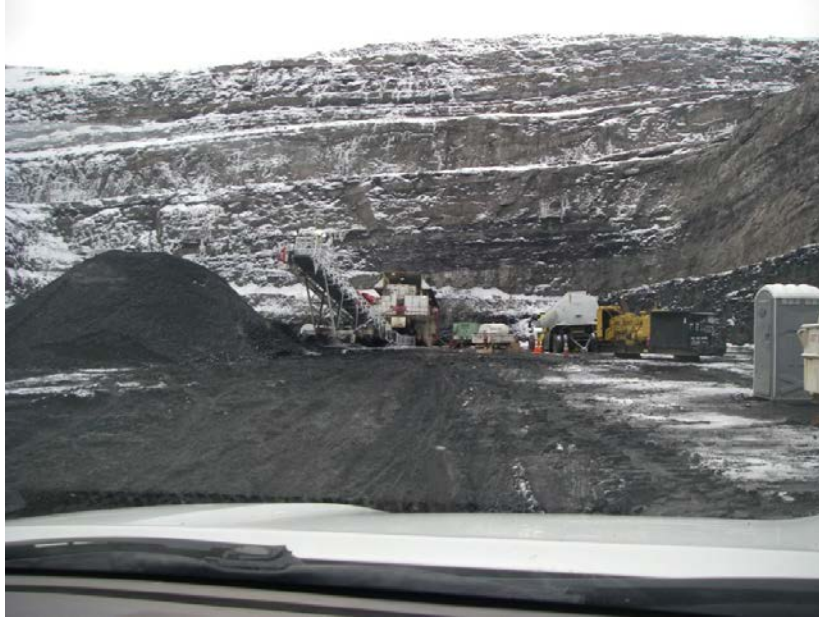
Highwall mining operation in South Taylor Pit