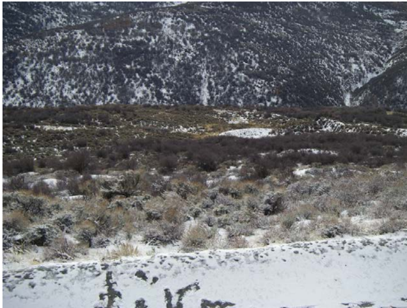
Slide area below Section 28 Ditch

Number of Partial Inspection this Fiscal Year: 6