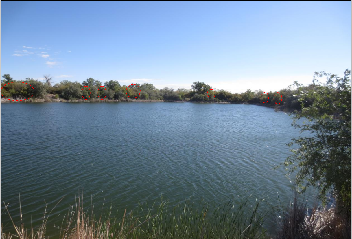
Photo 3: View looking across the pond, patches of tamarisk trees circled in red.