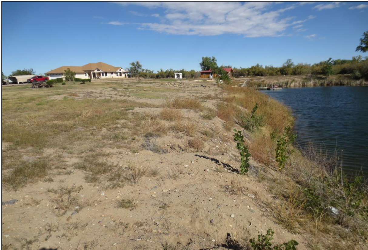
Photo 2: View looking north at the un-reclaimed pond slopes at approximately 1.5H:1V to 2.5H:1V. The beach area is in the background near the boat dock.