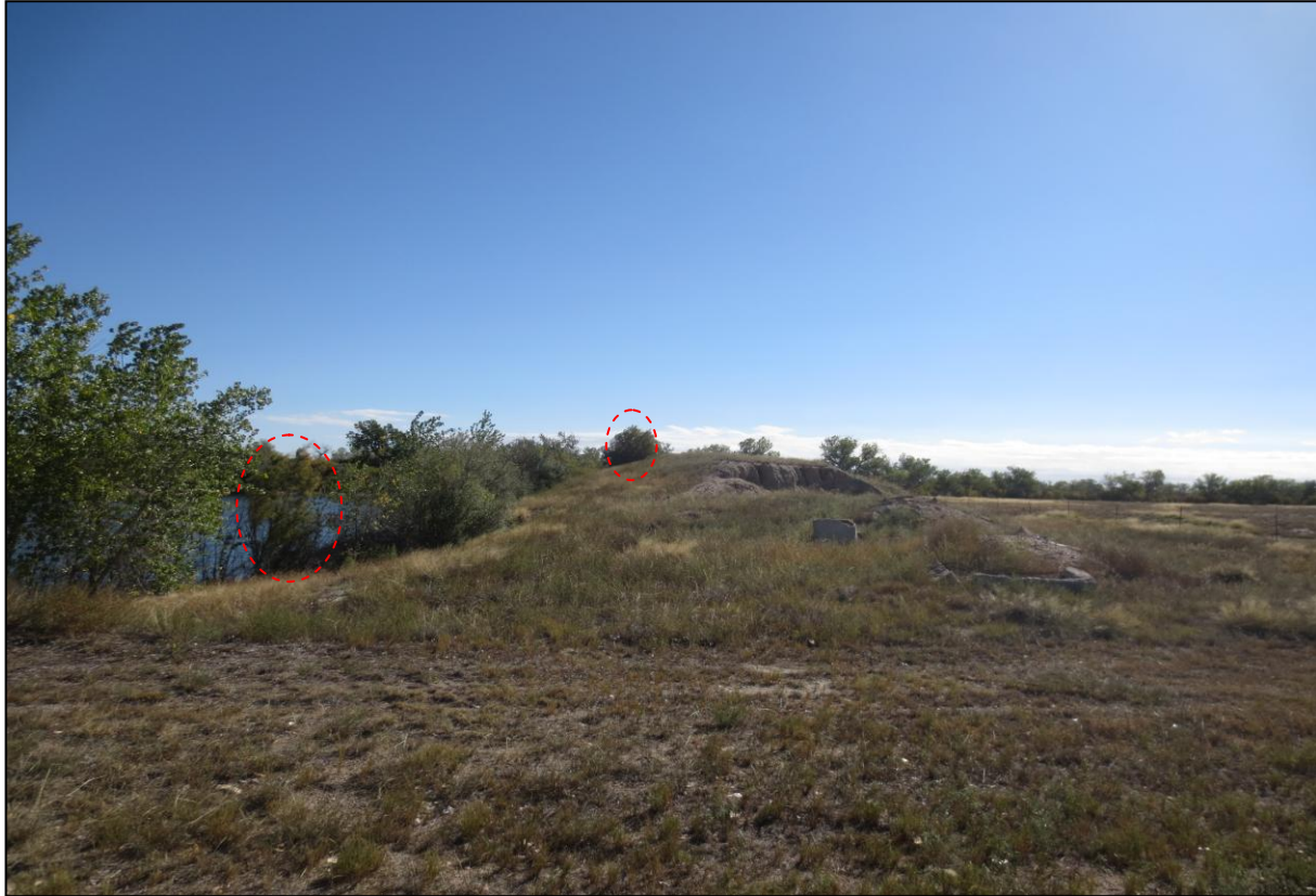
Photo 1: View looking east. Construction waste in the foreground, the stockpile of topsoil and overburden is in the background. The Tamarisk trees are circled in red.