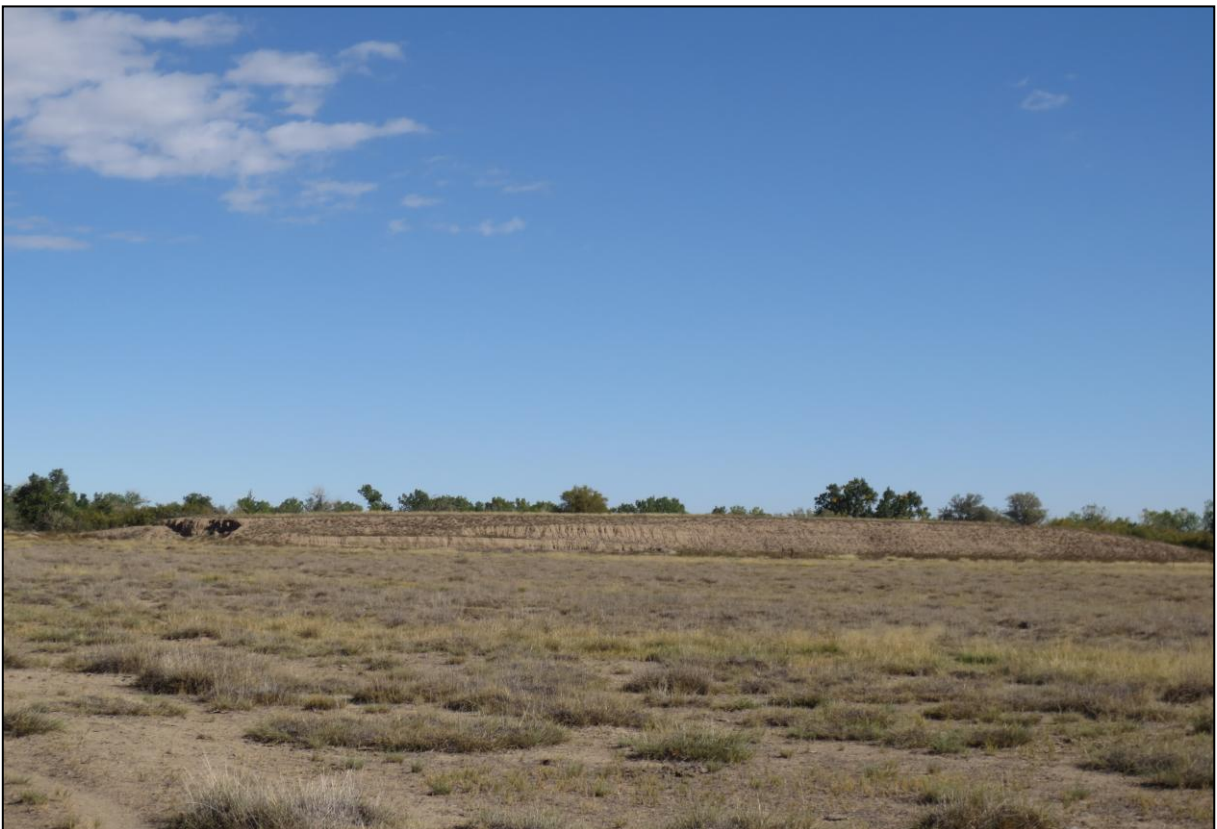
Photo 4: View looking northeast at the overburden and topsoil stockpile.