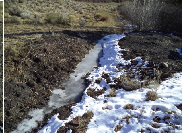
Photo 4 – P9 Emergency Spillway Directed to Refuse Pile Pond Ditch

Number of Partial Inspection this Fiscal Year: 0