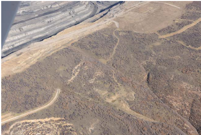
Section 28 Ditch and eastern edge of South Taylor Pit (ditch and slump in lower left portion of photo)

Number of Partial Inspection this Fiscal Year: 5