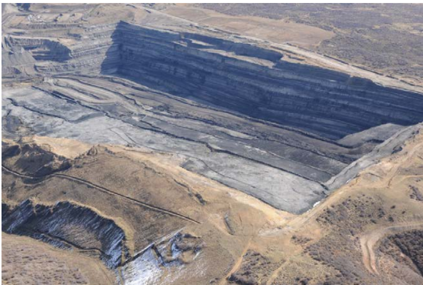
South Taylor Pit, looking east

Number of Partial Inspection this Fiscal Year: 5