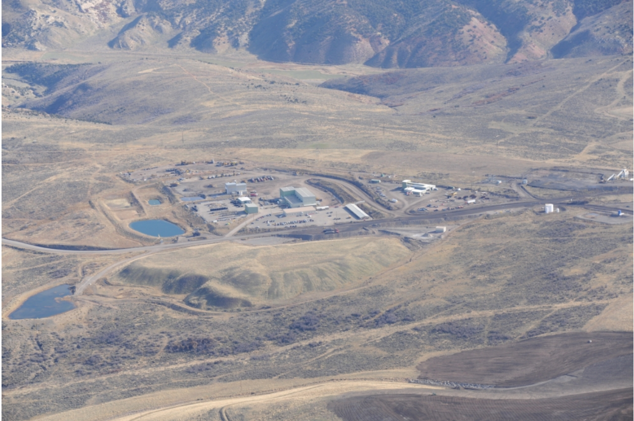
Main facilities area, looking east

Number of Partial Inspection this Fiscal Year: 5