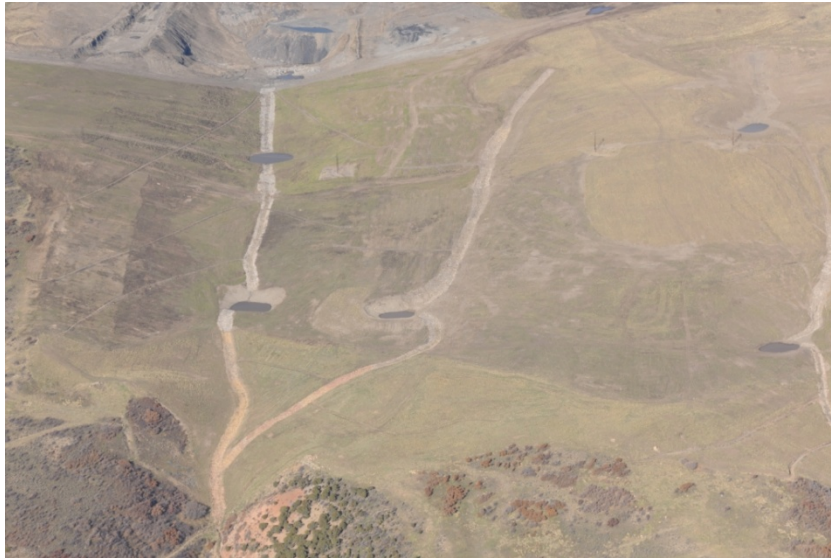
East Pit reclamation with ditches and stock tanks