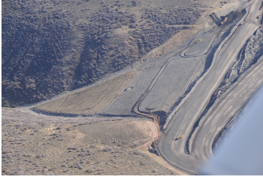
West Taylor Fill