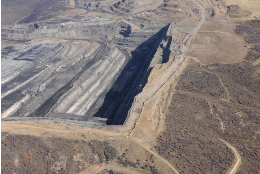
South Taylor Pit, looking north