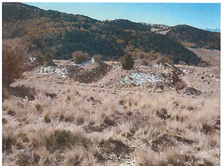
Photo 4. Existing heap leach pad.