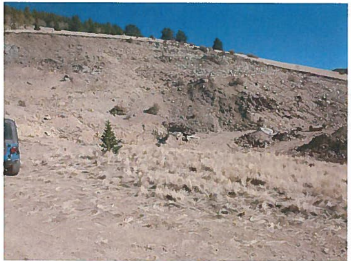
Photo 2. Historically disturbed area.