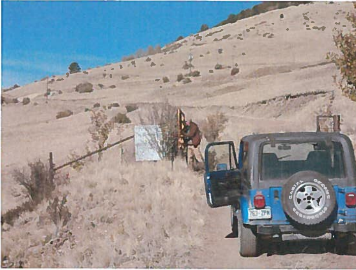
Photo 1. Locked access gate.