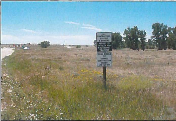
Figure 1 permit sign