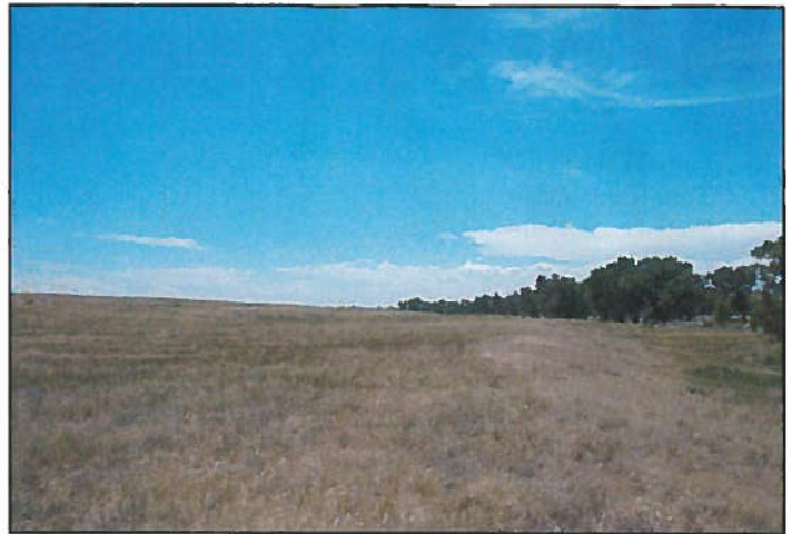
Figure 2 looking at reclaimed area 1 ( .57 acres)