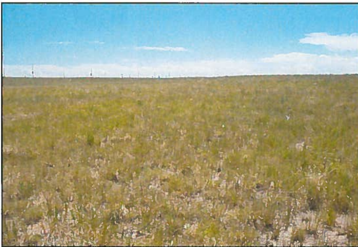
Figure 3 looking @ the reclaimed area 2 & 3