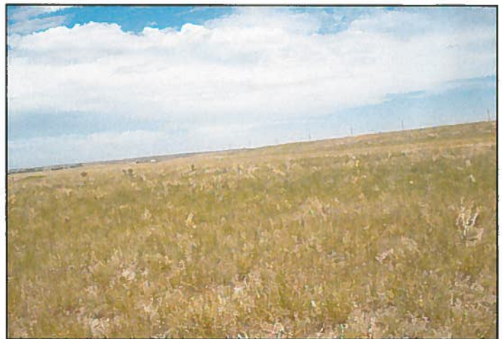
Figure 4 looking at the reclaimed are 5&6