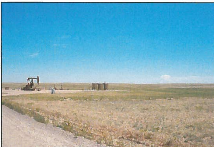
Figure 5 looking at the are now lease by oil production appx 88 acres