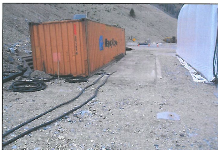
Electric storage zircon, concrete pad, cable.