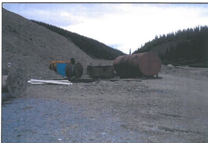
Vent portal, with cable and storage tank.