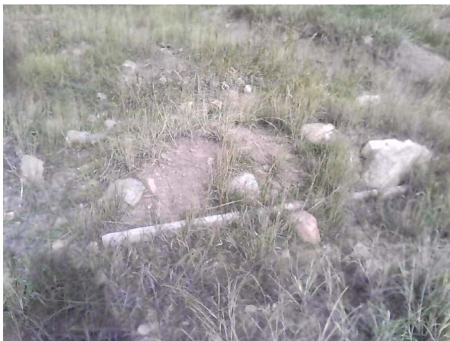
Raised material in Ditch 1 at intersection with Ditch 3