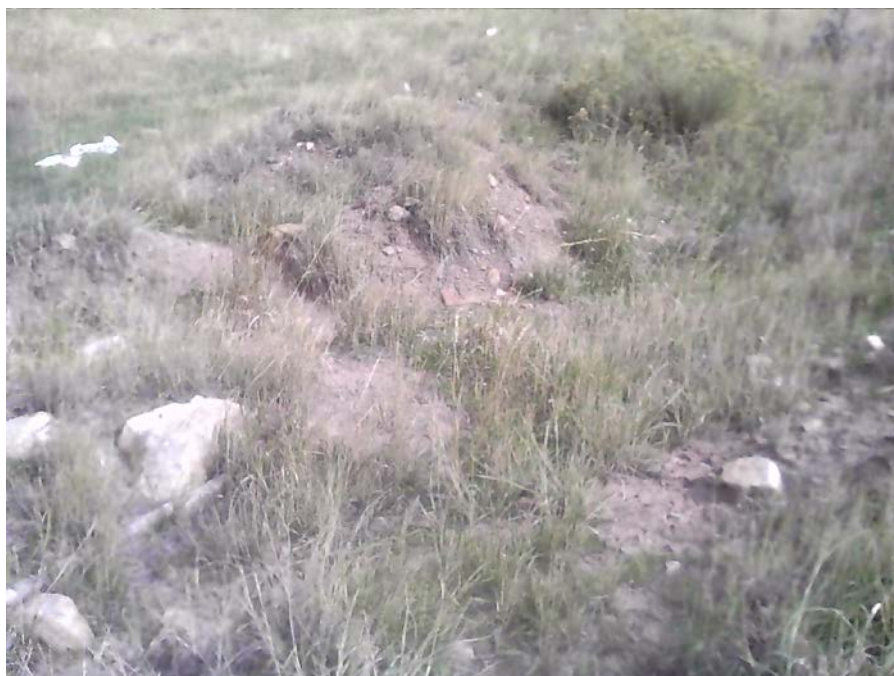
Raised material in Ditch 1 at intersection with Ditch 3

Number of Partial Inspection this Fiscal Year: 0