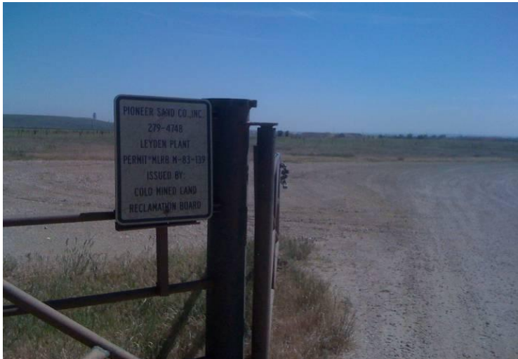
Photo 3 - Sign at site entrance gate.