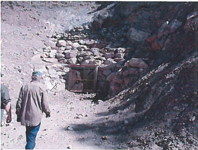
Figure 5: May Day 1 access portal and highwall.

Conditions in this area appeared unchanged from the Division's previous inspection.