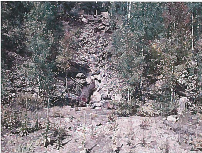
Figure 11: May Day 3.

Conditions in this area appeared unchanged from the Division's previous inspections. Signs of any recent activity were not observed.