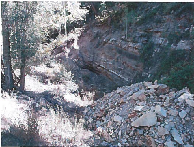
Figure 8: View from access road toward the May Day 2 portal.

Conditions in this area appeared unchanged from the Division's previous inspection. The restoration of Little Deadwood Gulch, as approved through TR-4, has not yet commenced. There was no water observed in Little Deadwood Gulch.