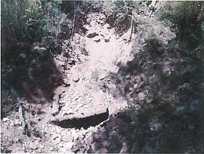
Figure 10: Chief Tunnel collapsed opening.