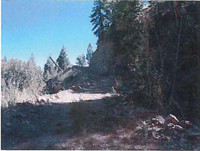
Figure 3: Looking up the access road.