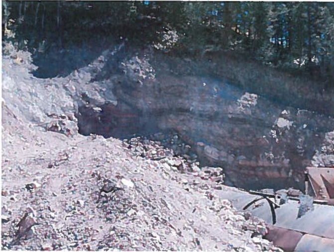
Figure 7: Highwall above the access portal.