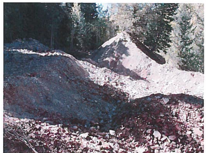
Figure 9: View from the pad area west of the access road, facing down slope.