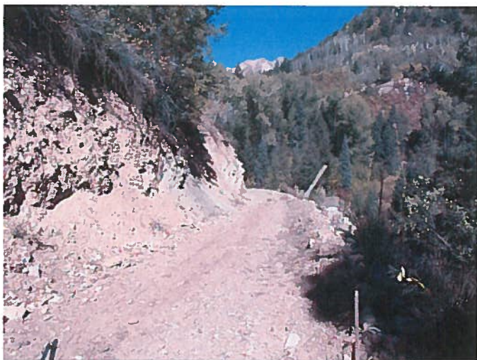
Figure 1: Looking down the access road.

Renovation of the La Plata River bridge, as approved through TR-3, has not yet commenced. Evidence of the operator's utilization of the road for vehicular access to the site was not observed during this inspection.