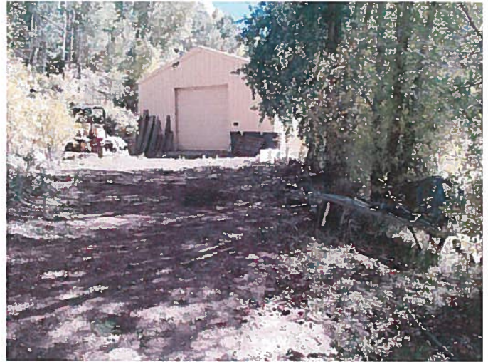
Figure 13: Area on the north side of the mill building.

Responses to this inspection report should be directed to Dustin Czapla at the Division of Reclamation, Mining and Safety, Grand Junction Field Office, 101 South 3 rd Street, Room 301, Grand Junction, Colorado 81501, phone number (970) 243-6299.