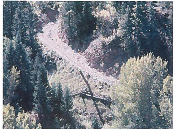
Figure 4: View of the access road from across the canyon.