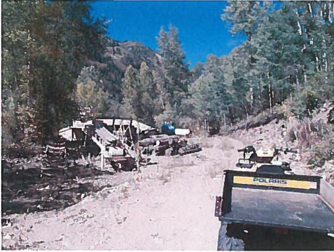
Figure 12: Area on the south side of the mill building.