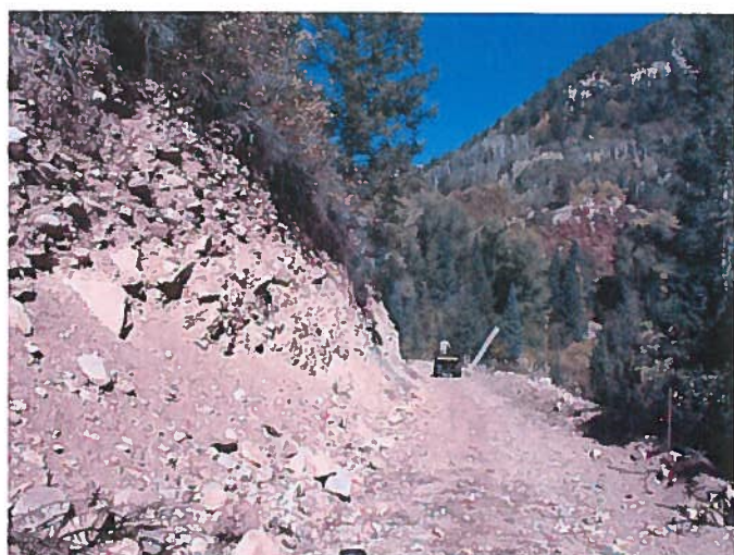
Figure 2: Looking down the access road.