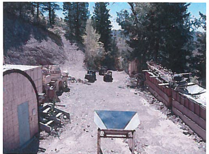
Figure 6: View of May Day 1 area from the north side of the pad.