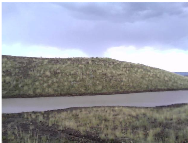
STOCKPOND AND EAST FACING SLOPE