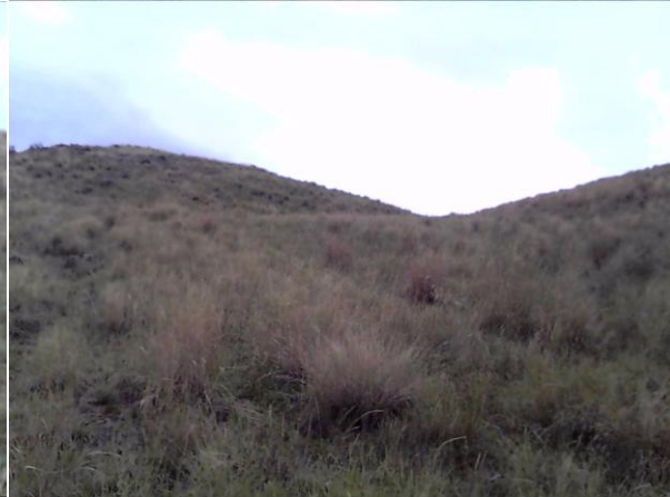
NORTH FACING SLOPES