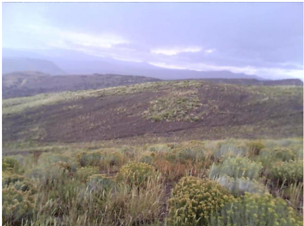
SOUTHEAST SLOPE ABOVE POND

Number of Partial Inspection this Fiscal Year: 2