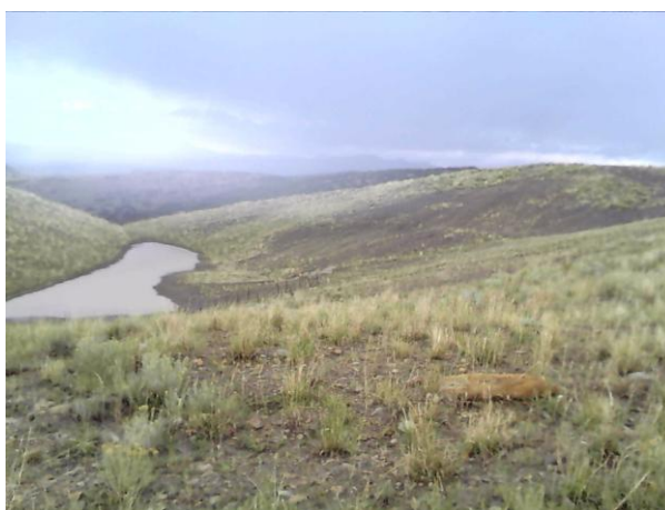
POND LOOKING NORTH