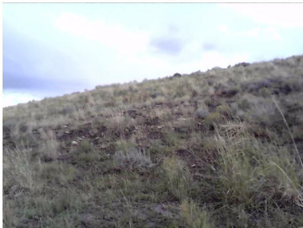
NORTHEAST FACING SLOPE