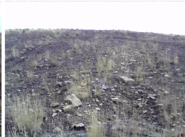
SOUTHWEST FACING SLOPE

Number of Partial Inspection this Fiscal Year: 2