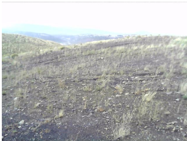
SOUTHWEST FACING SLOPE