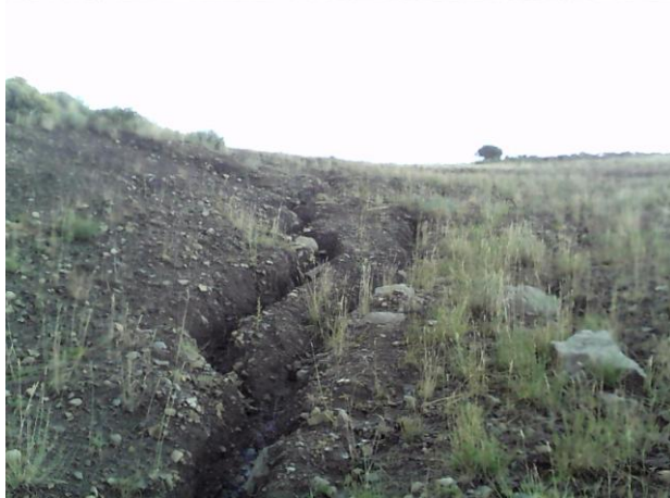
EROSION ABOVE STOCK POND