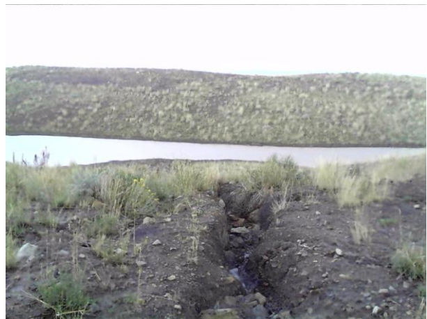
EROSION ABOVE STOCK POND

Number of Partial Inspection this Fiscal Year: 2