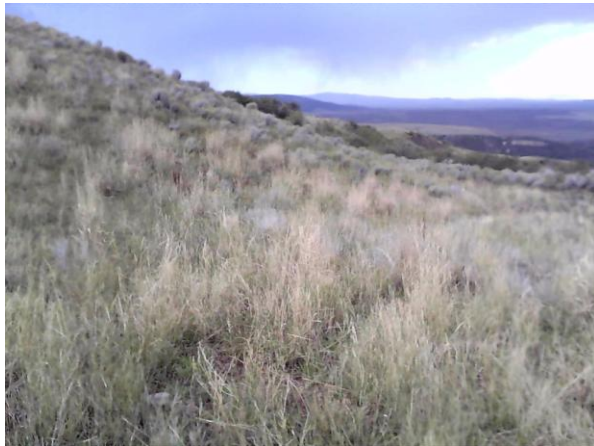
NORTH FACING SLOPE