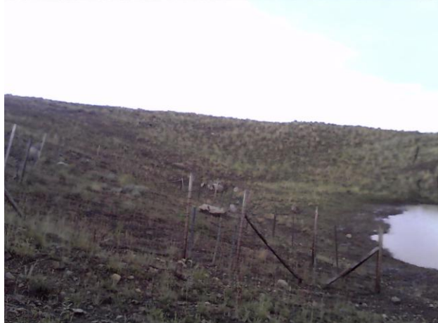
FENCED VEGETATION PLOT