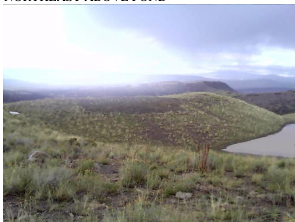
NORTHEAST SLOPE ABOVE POND