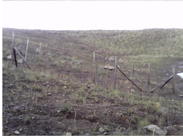
FENCED VEGETATION PLOT