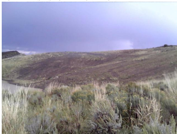
SOUTHWEST SLOPE ABOVE POND

Number of Partial Inspection this Fiscal Year: 2