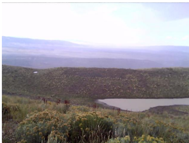
NORTHEAST ABOVE POND