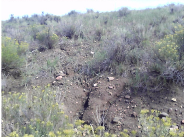
Photo 6: slope on northwest corner of truck tunnel requires stabilization.