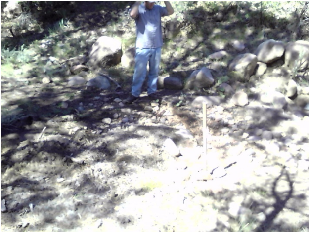
Photo 3: Landowner's stake marking point Newlin Creek flow previously infiltrated into channel