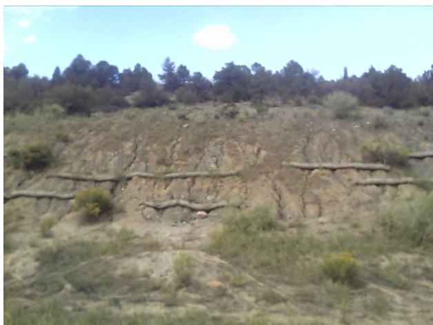
Photo 10: slope north of parking are. Slope and wattles need repair.

Number of Partial Inspection this Fiscal Year: 2