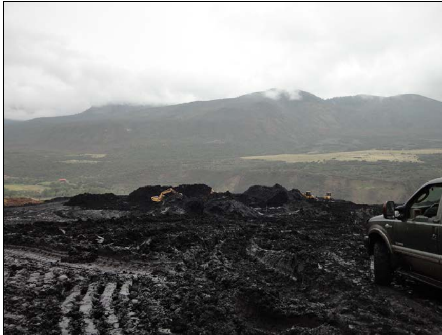
Photo 1 Eastern flank of Gob Pile #2, remaining end- dumped material subject to NOV CV2013004