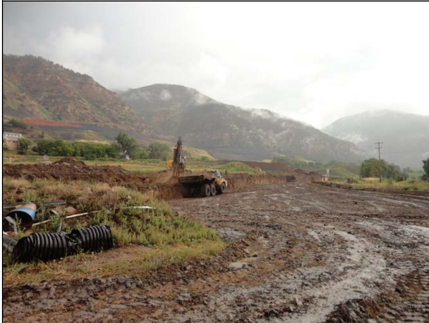
Photo 10 Cover material excavation on east end of Gob Pile #3 disposal area

Number of Partial Inspection this Fiscal Year: 4