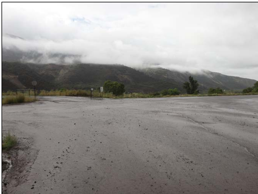
Photo 11 Crossing over Old Highway 133 from mine haul road to Gob Pile #3 haul road

Number of Partial Inspection this Fiscal Year: 4