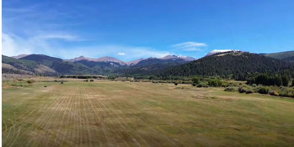
SLV site (7 structures)