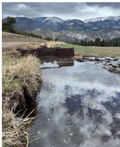
Elk Creek Site (4 structures)

Trout Unlimited's mission: To conserve, protect, and restore North America's coldwater fisheries and their watersheds.