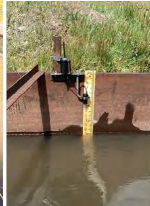
Water level Razor Creek

In 2024, TU and Ethos are working on installing two additional gateways in the Gunnison basin to provide communication with sensors in Quartz Creek and Razor creek. These sensors will include stream temperature, stream water level, and ditch/flume level.