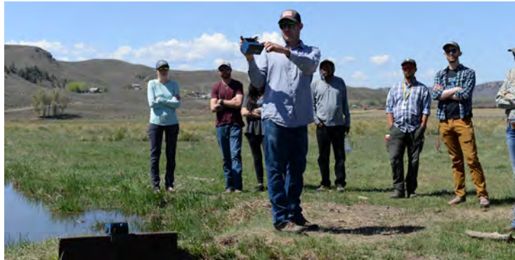
May 2022 site visit (Cranor Ranch)

TU has hosted 5 field tours and presented at 4 agriculture water workshops and directly interacted with 200 agricultural producers discussing this work. In addition to site visits and presentations, several articles have been written about the project including this article in the Denver Post.