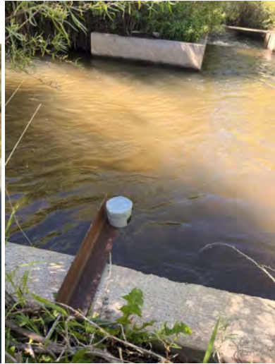
Vega Radar on Trampe Lateral