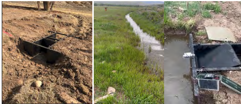
Cranor Site (6 structures)

Trout Unlimited's mission: To conserve, protect, and restore North America's coldwater fisheries and their watersheds.