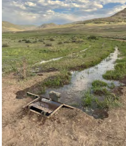
Razor Creek site (7 structures)