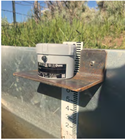
Vega Radar sensor in Cranor flume