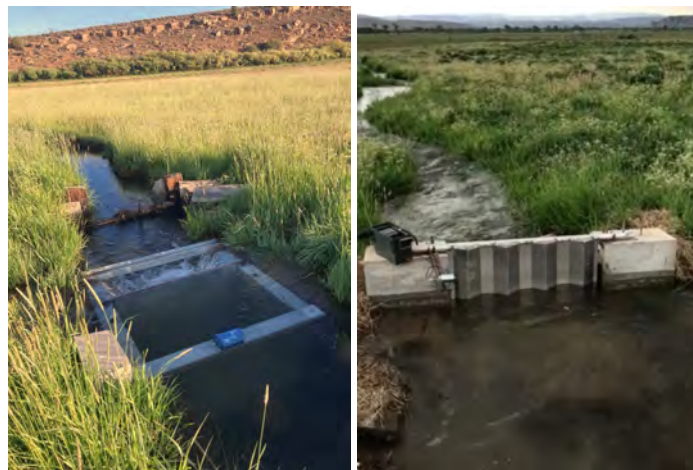
Trampe Site (15 structures)