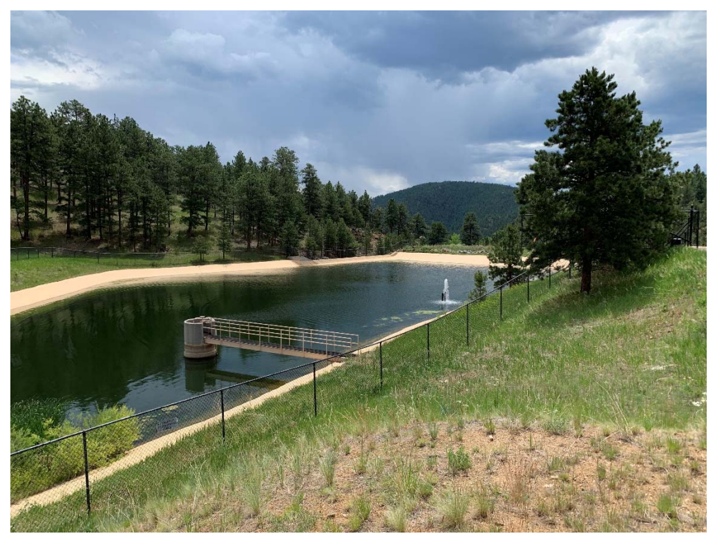
Figure C2. View of Genesee Dam No. 1 Reservoir, looking downstream at the upstream slope and service spillway.