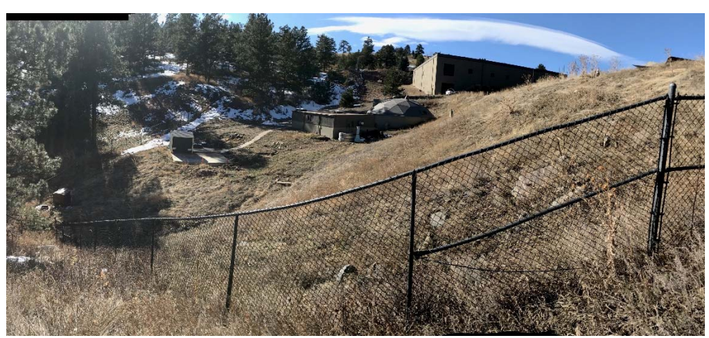
Figure C5. View of Genesee Dam No. 1 downstream slope, looking right from the left abutment.