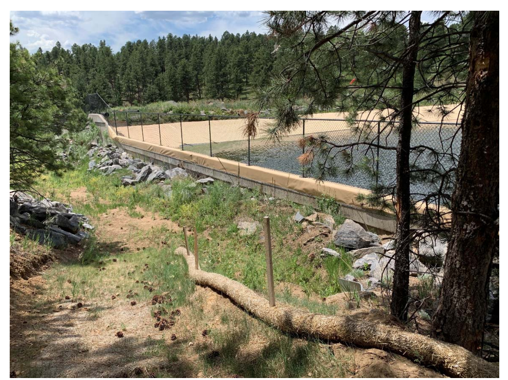
Figure C4. View of Genesee Dam No. 1 spillway, looking upstream at the spillway control section.