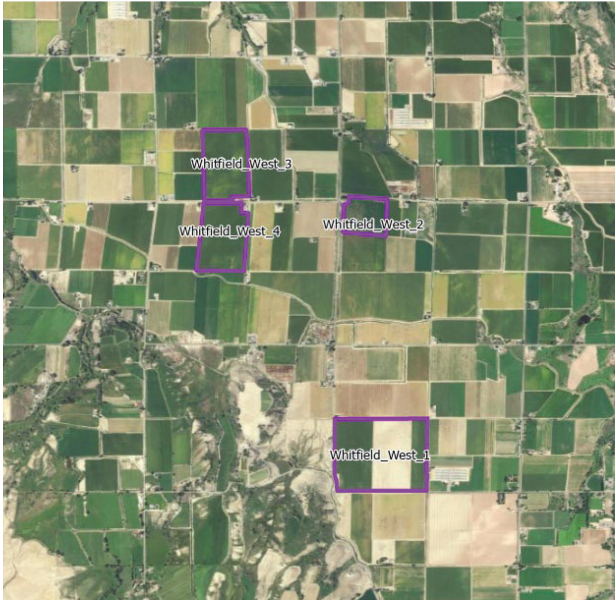
Figure 1 – Map of Project Fields - West