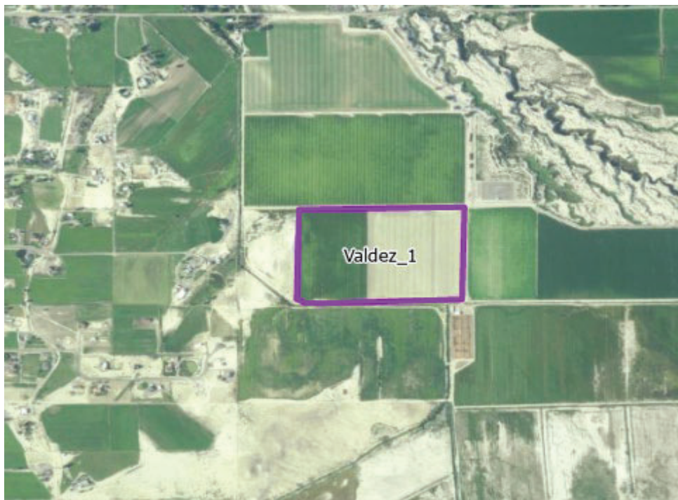
Figure 1 – Map of Project Fields