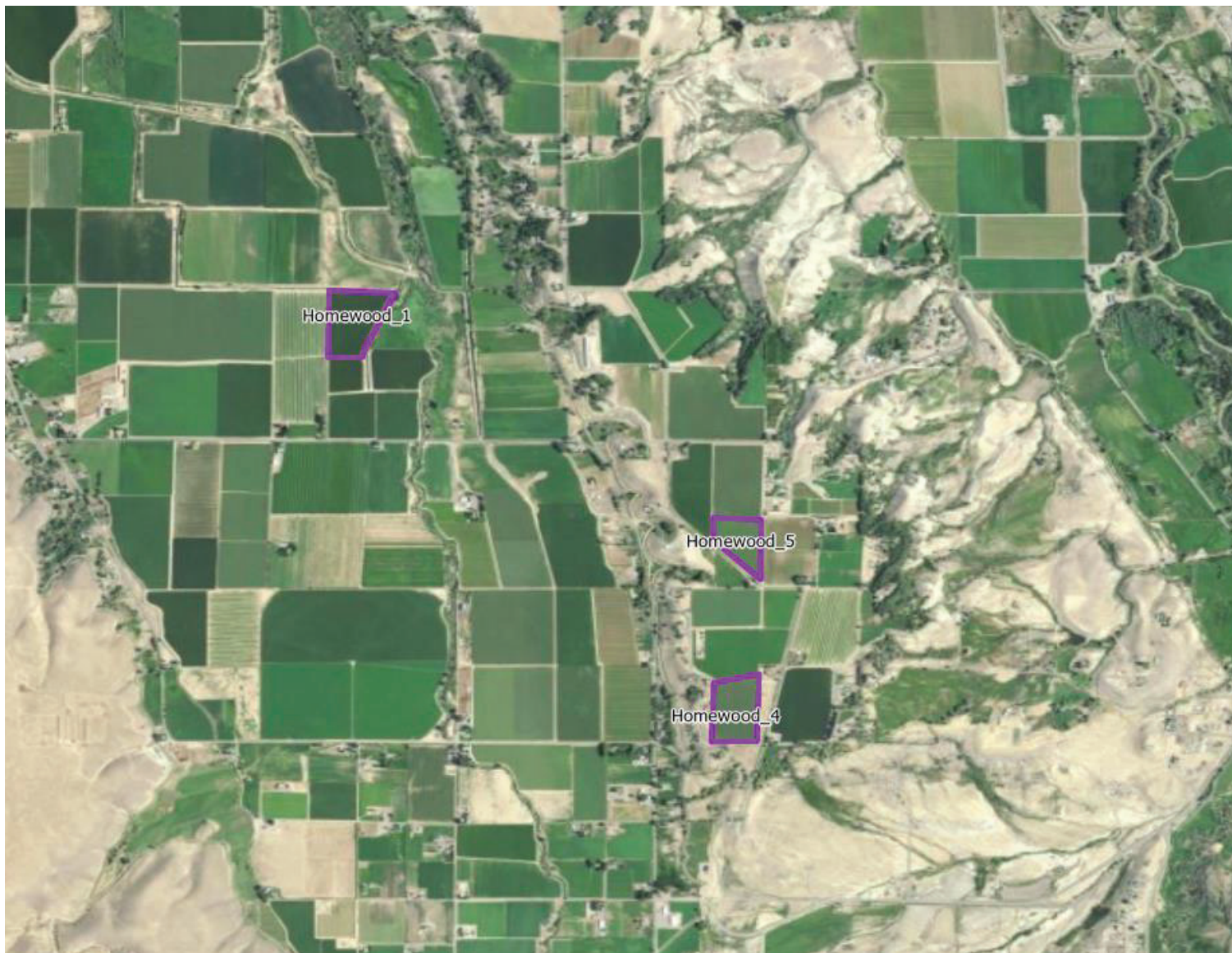
Figure 1 – Map of Project Fields